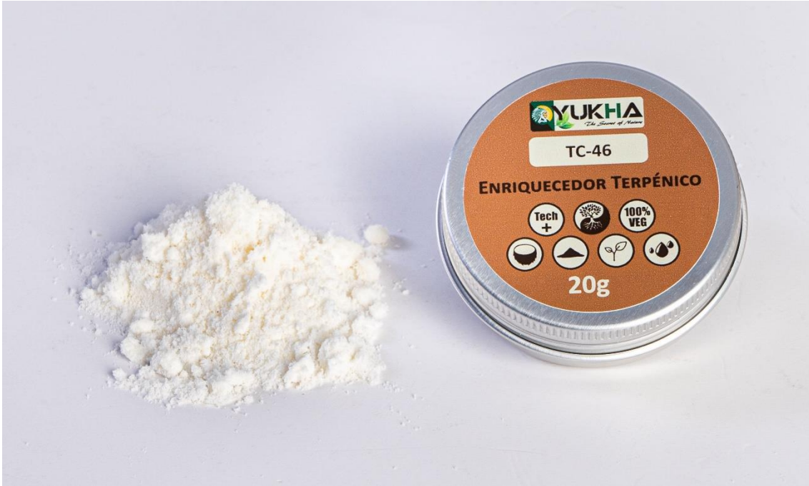
TC-46 Terpene Enricher "Technical product" 20 gr