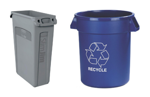
Standardized to fit Rubbermaid 23 gallon Slim Jim and 44 gallon brute.