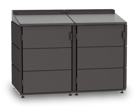
2-module standard-size CITIBIN trash enclosure, charcoal cladding, with planter.