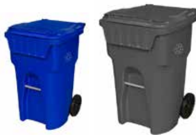
Standardized to fit most 65 to 95 gallon wheeled trash carts.