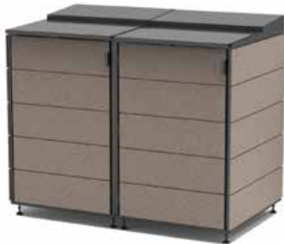
2-module XL-size CITIBIN trash enclosure, cladding, with sectional top door.