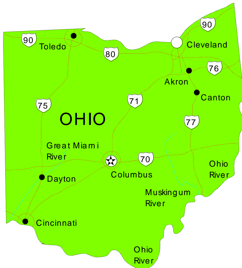
Map of Ohio – Capital, Major Lakes and Rivers

People who live in Ohio or who come from Ohio are called Ohioans and sometimes they are referred to as Buckeyes.