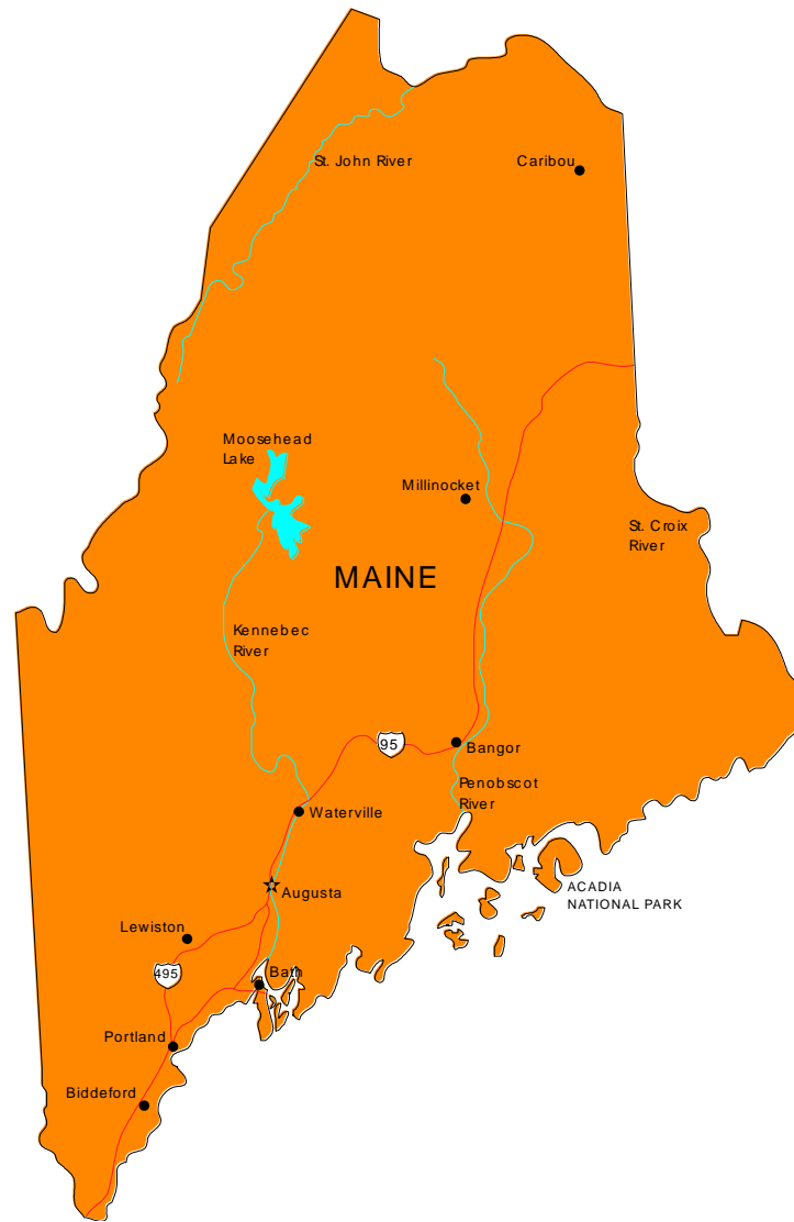
Map of Maine – Capital, Major Cities, Lakes and Rivers