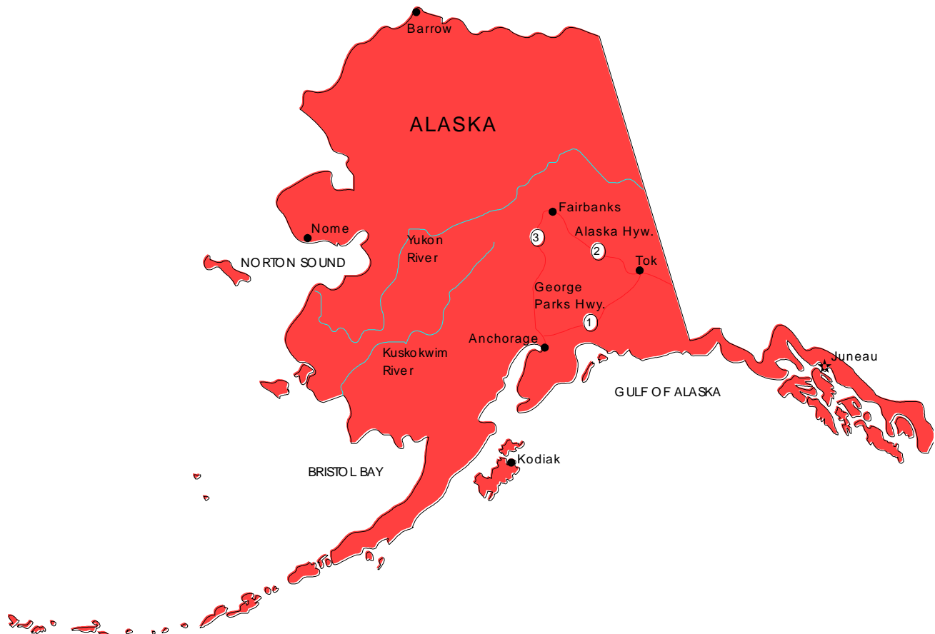
Map of Alaska – Capital, Major Cities and Rivers

People who live in Alaska or who come from Alaska are called Alaskans.