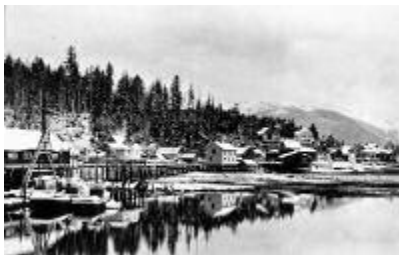
Village of Klawak - 1927 West coast Prince of Wales Island Home of Alaska's 1st Salmon Cannery

Momentum was building. Interest in the area's salmon fisheries had caused the first canneries to be built in Alaska in 1878. The discovery of gold in 1880 and the gold rush of 1897-1898 attracted thousands of people hoping to strike it rich. Alaska's population nearly doubled, in ten years, to 63,592 by 1900.