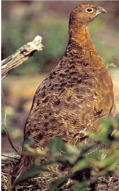
Willow ptarmigan in summer plumage