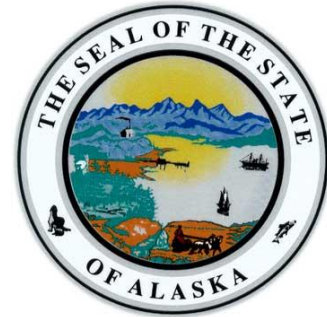
The Great Seal of Alaska