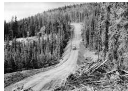
Alaska (Alcan) Highway between Edmonton, Canada and Fairbanks, Alaska

Additional bills were introduced throughout the mid-1940s, but it wasn't until 1958 that Congress voted to admit Alaska to the Union. Alaska was inducted into the Union in 1959. On January 3, 1959, President Eisenhower signed the official declaration, which made the territory of Alaska the 49th state. Alaska became the first new state admitted to the Union since 1912. The headline in the Anchorage News read "IKE SAYS: YOU'RE IN NOW!"