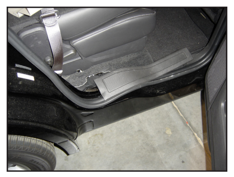
STEP 2 Remove the passengers side rear door sill.