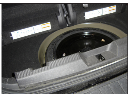
Remove the false floor and, the tailgate, and door sill.