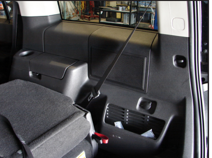
STEP 1 Empty out the back of the vehicle.