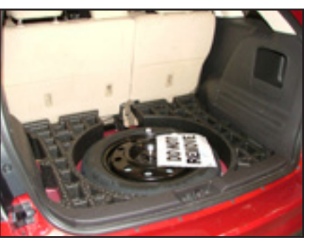
STEP 1 Remove the floor panel by lifting seat flaps. Carefully tilt entire panel to exit hatch diagonally.