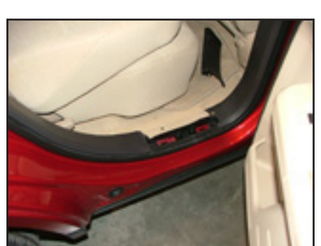
STEP 5 Remove passenger side threshold plate.

Remove bolt securing seat belt at lower front of cargo side panel.