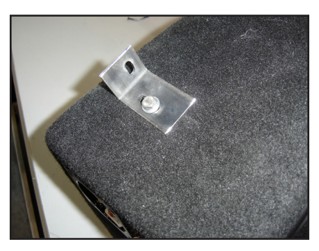
S T E P 1 3 Attach the L- Bracket to the top of the Stealthbox® using a 1/4"-20 x 1 Bolt, a 1/4" Lock Washer, and a 1/4" Flat Washer, as shown, and hand tighten.