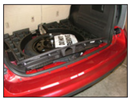
STEP 2 Remove threshold plate by lifting directly upward.