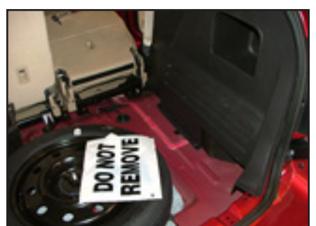
Remove foam filler panel or plastic storage tray from passenger side of spare tire.