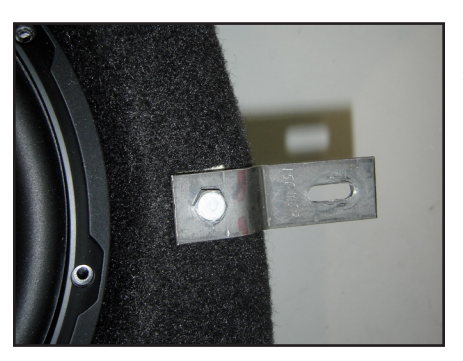
S T E P 1 2 Attach the Z-Bracket to the front of the Stealthbox® using a 1/4"-20 x 1 Bolt, a 1/4" Lock Washer, and a 1/4" Flat Washer, as shown, and hand tighten.