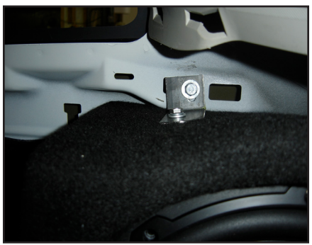
STEP 17 Using a 1/4"-20 x 1 Bolt, a 1/4" Lock Washer, and a 1/4" Flat Washer, attach the L- Bracket to the Stealthbox®, and hand tighten.

Next, firmly tighten all three brackets onto the Stealthbox ^{\circ} , then firmly tighten the Z-Bracket and L-Bracket to the vehicle.