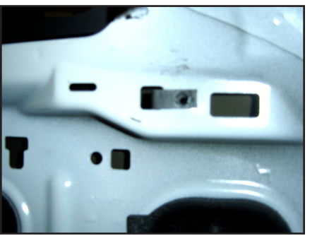
STEP 9 Insert a 1/4"-20 U-Nut into the square hole near the side window, as shown.

In vehicles equipped with the factory subwoofer, the existing U-Nut can be used here instead, as well as in Steps 9-10 .