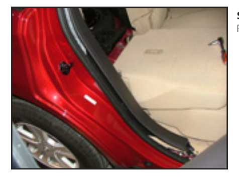
S T E P 6 Pull passenger side cargo panel away from the door jamb.