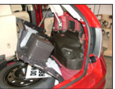
Remove passenger side cargo panel by prying away from side of vehicle and floor. If equipped, unbolt and remove the factory subwoofer enclosure.