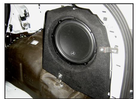
STEP 19 Pictured is the Stealthbox® secured into position.

Place a 1/4" Lock Washer and a 1/4" Flat Washer over a 1/4"-20 x 1 Bolt, and thread the assembly through the hole in the Z-Bracket and into the 1/4"-20 U-Nut, as shown, and hand tighten.