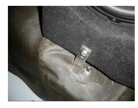
S T E P 1 6 Using a 1/4"-20 x 1 Bolt, a 1/4" Lock Washer, and a 1/4" Flat Washer, attach the Large Bracket to the Stealthbox®, and hand tighten.