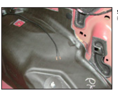
Route speaker cable to the Stealthbox location as necessary.

Insert a 1/4"-20 U-Nut into the square hole just above the wheel well, and align the Large Bracket, as shown. Place a 1/4" Lock Washer and a 1/4" Flat Washer over a 1/4"-20 x 1 Bolt, and thread the assembly through the hole in the Large Bracket and into the 1/4"-20 U-Nut, as shown. Firmly tighten to secure the Large Bracket to the vehicle.