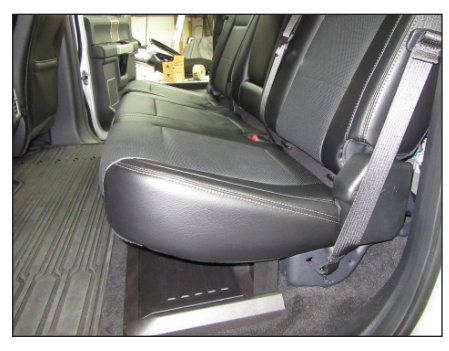
STEP 1 Empty the rear seat area.