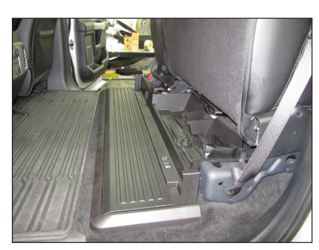
STEP 2 Lift the rear seat.

Remove the two factory nuts from each side of the tray.