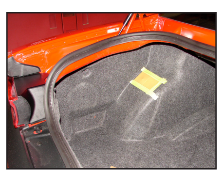
STEP 2 Place the 3" x 3" wax square as shown.