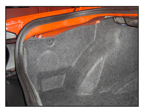
STEP 1 Clean the trunk out so that you have a good environment to