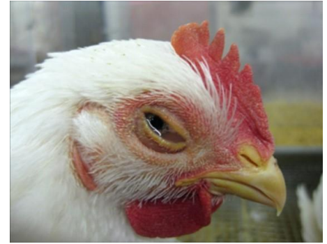
Infectious Laryngotracheitis in Poultry - Poultry - Merck Veterinary Manual ( merckvetmanual.com )

ILT is a viral respiratory disease of poultry, fowl and other birds. Clinical signs range from mild disease including discharge from the eyes and nose, sneezing and a drop in egg production to more severe signs including coughing up blood, bloody discharge from the nose and mouth, gasping for air, and death. It takes anywhere from 6 to 14 days from when the bird becomes infected to when it shows clinical signs allowing for asymptomatic spread during this time. Five to 100% of the flock may become sick and 0 to 20% of the flock may die.