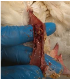
Blood and exudate in the trachea of a bird with ILT

ILT is most commonly spread to susceptible birds through direct contact with infected birds. The virus can be spread between barns and farms via inanimate objects however, such as contaminated equipment, vehicles, clothing and footwear. Winds can also carry the virus downwind of infected barns and manure. Enhanced biosecurity is therefore critical to prevent spread.