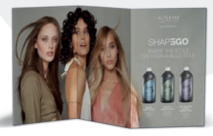
SHAPEGO PANCARD 630 x 297 AEI 8032552