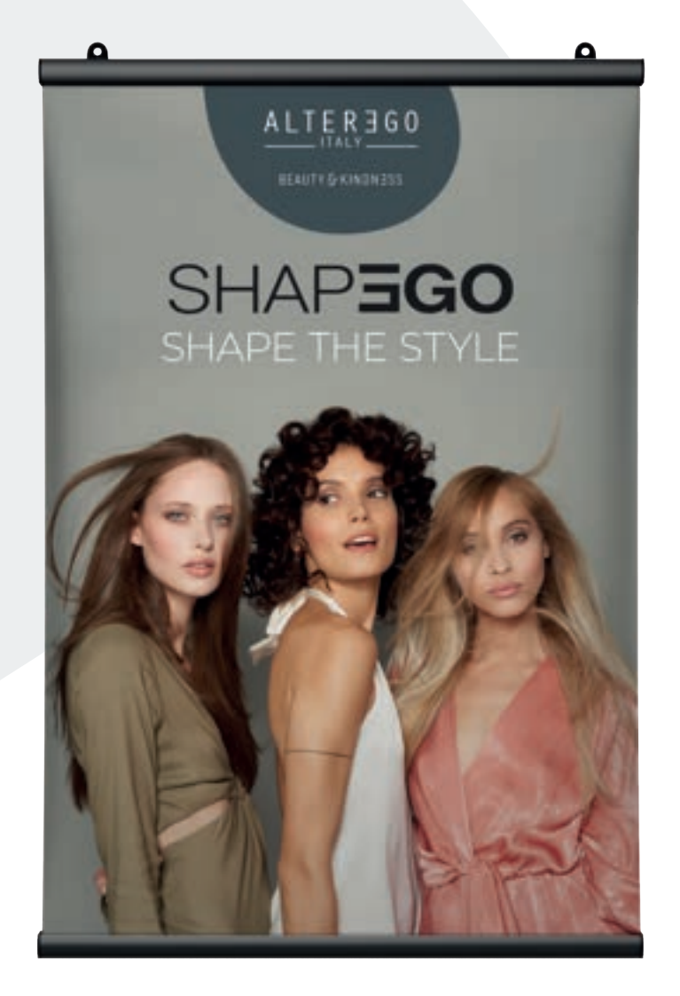
SHAPEGO BANNER 70 x 100 AEI 8032551