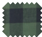
Vert / Forêt Green / Forest