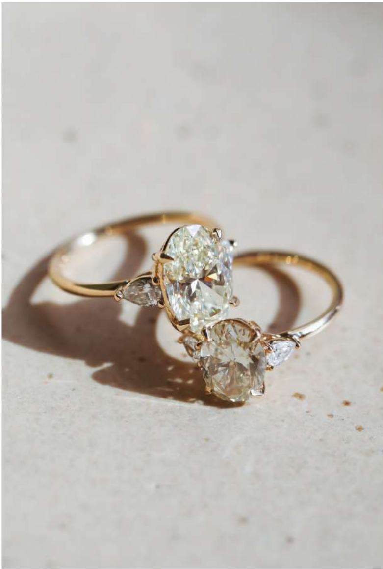
Grew & Co Sassa Yellow 2.00 (top), $19,900, and Sassa Oval Champagne 2.41, $17,100. Shop online at Grew and Co.