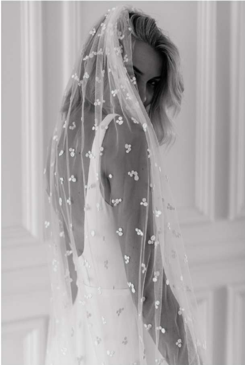
Made With Love Bridal Rosey Veil, $310. Shop online at Made With Love Bridal .