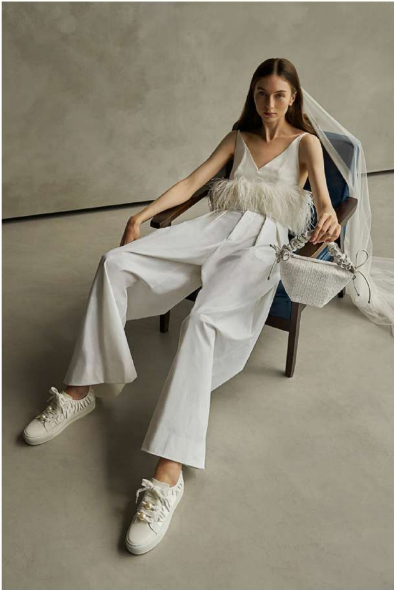
Charles & Keith Blythe Leather & Satin Bead-Embellished Sneakers, $126, and Leather & Lace Ruched Top Handie Bag, $146. Shop online at Charles & Keith .