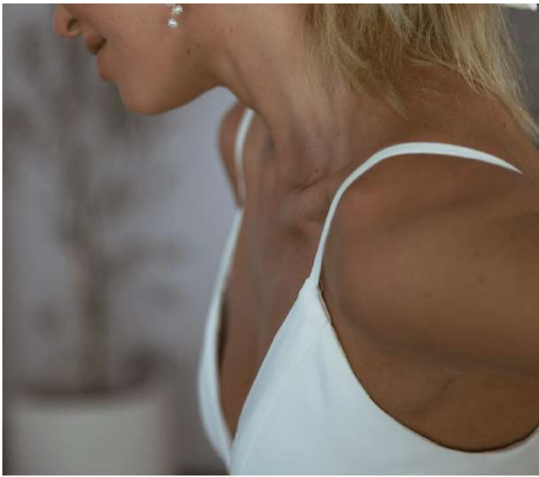
LolaKnight Balbina Silk Satin Hair Scarf, $85, and Maree Pearl Hoop Earrings (18ct gold), $155. Shop online at LolaKnight .