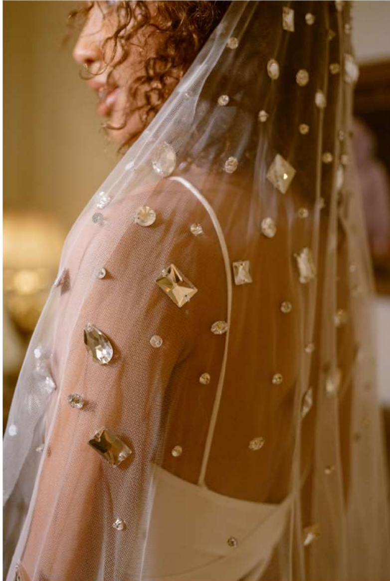
Grace Loves Lace Celestial Veil, $660. Shop online at Grace Loves Lace .

Yep, we're calling it - this is the bridal accessories roundup you need in your life. You're so welcome!