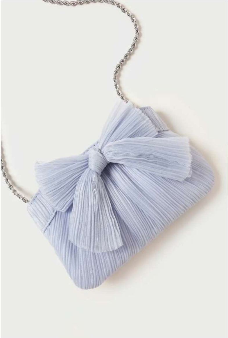
Loeffler Randall Rochelle Mini Bow Clutch in Blue, $275. Shop online at Hope X Page .