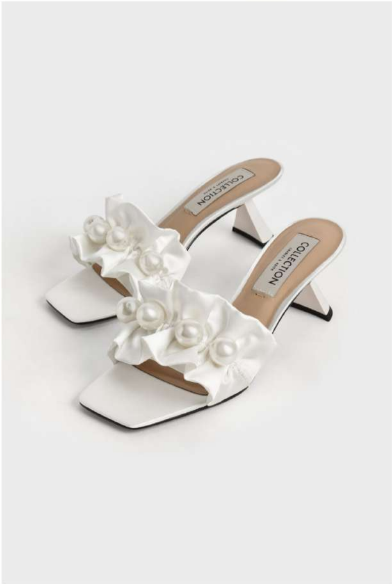
Charles & Keith Blythe Bead-Embellished Satin Mules, $116. Shop online at Charles & Keith .