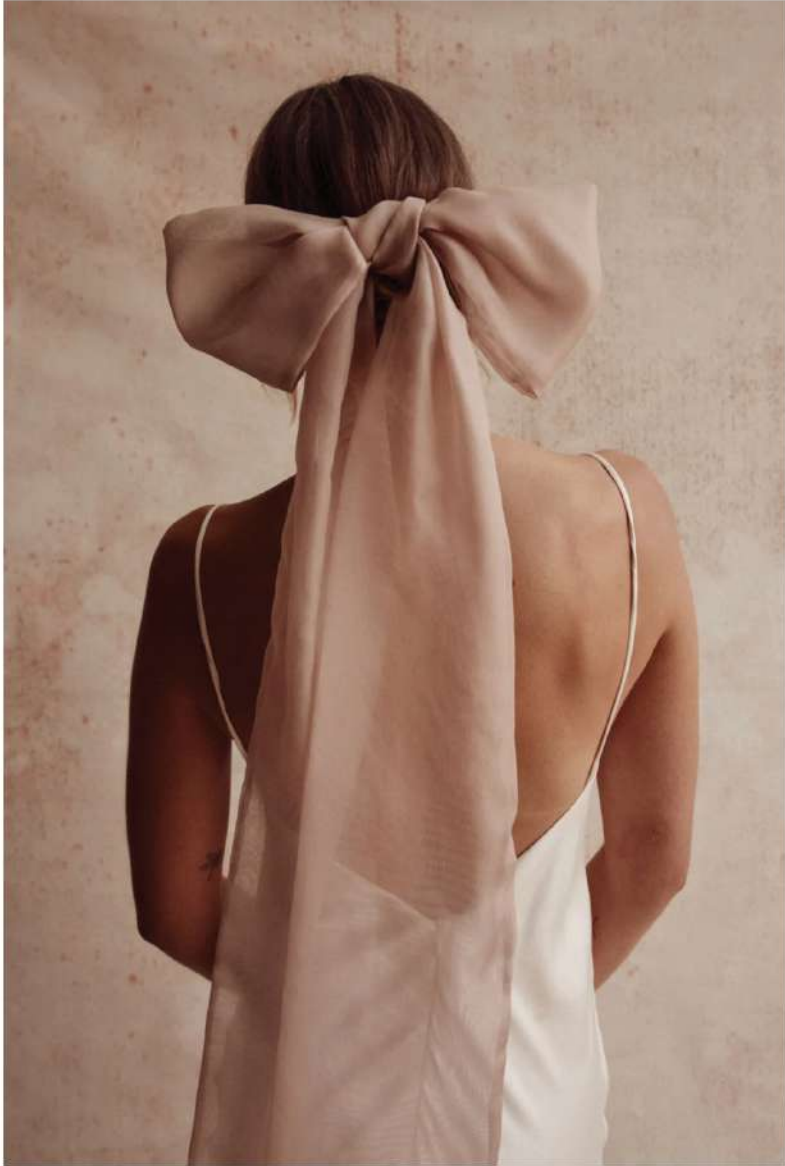
Dove Grey Bridal Goldie Organza Bow , $280. Shop online at Dove Grey Bridal .