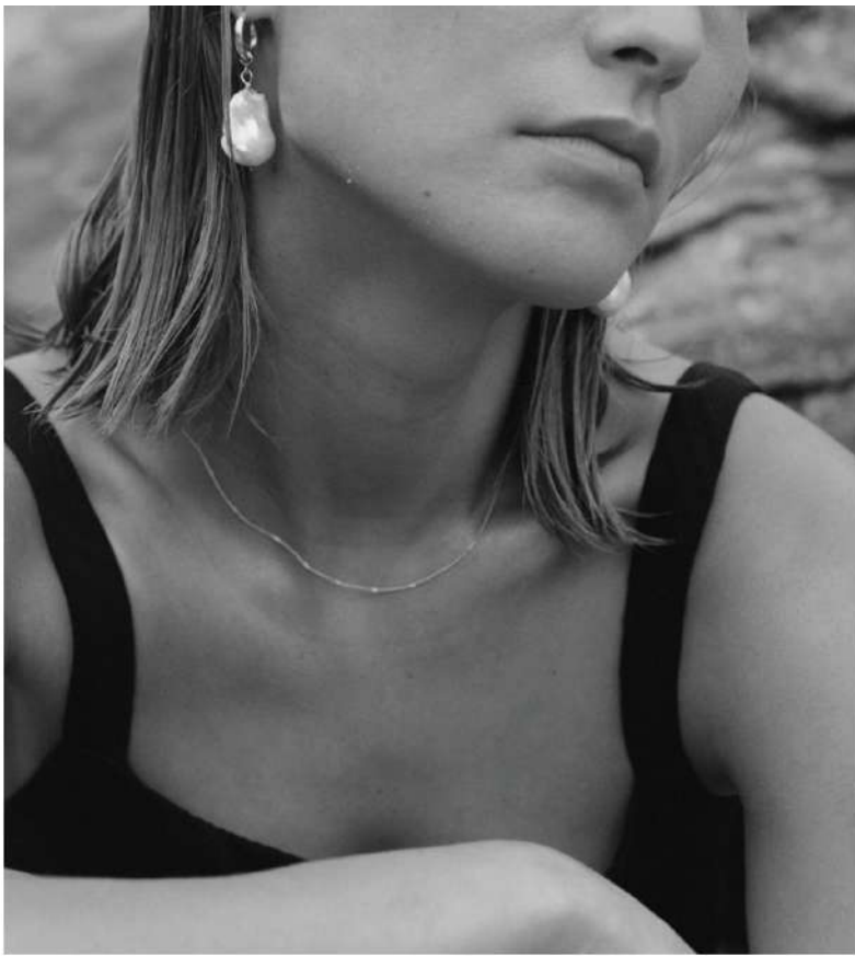
Kate & Kole Bold Pearl Drops, from $790. Shop online at Kate & Kole .