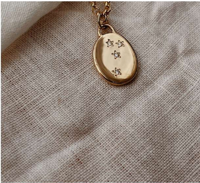
RUUSK Constellation Collection Scorpio Pendant, from $1270. Shop online at RUUSK .