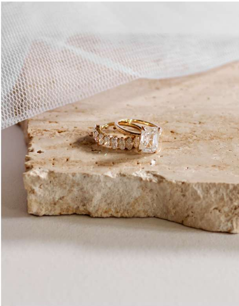
The Moissanite Company Gia Ring Half Oval Band, from $2740, and Audrey Ring Emerald Solitaire, from $2100. Shop online at The Moissanite Company .