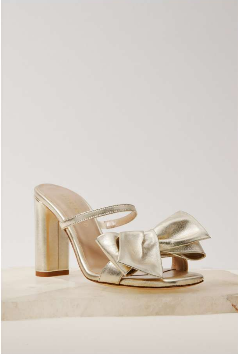
Meggan Morimoto Martina Mule with Obi Bow (detachable), $949. Shop online at Meggan Morimoto .