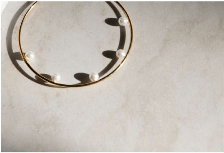
Anastasia Marie The Label Monica Earrings, $179. Shop online at Anastasia Marie The Label .