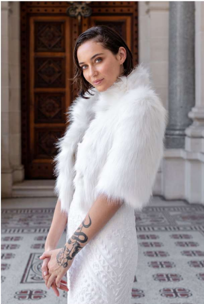
Unreal Fur Desire Cropped Jacket, $389. Shop online at Unreal Fur .