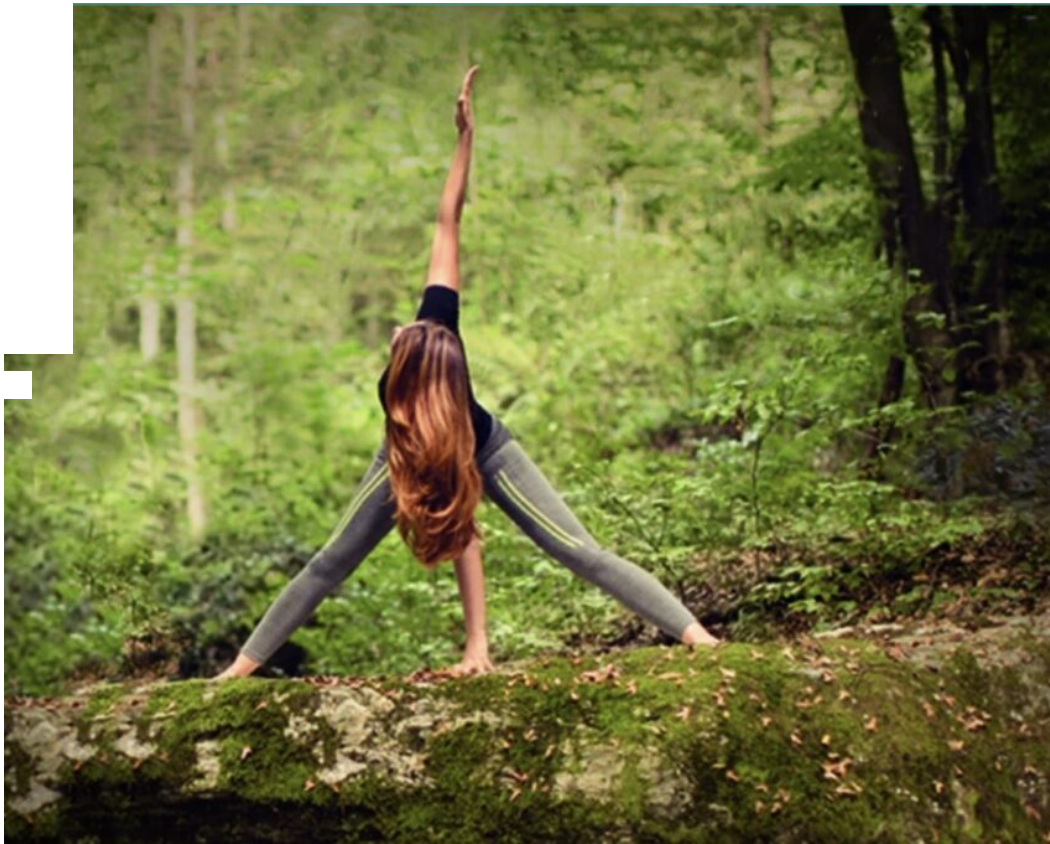
Harmony 783 shoes are made to get grounded with the Earth.