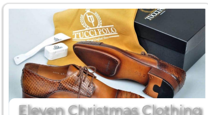
Eleven Christmas Clothing