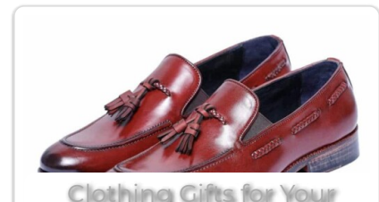
Clothing Gifts for Your