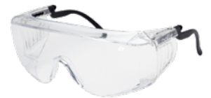
1650515 • Clear wrap-around frame