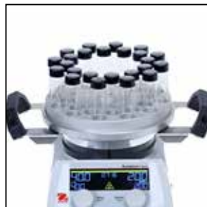
Base Plate and Handles