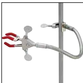
Ultra Flex Support Kit