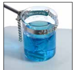
Vessel Clamps and Clamp Kit

*40 accessories available for Guardian Series