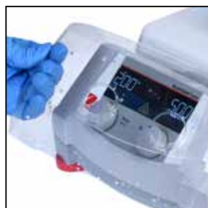
In Use Cover