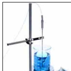
Support Rod and Clamp Kit