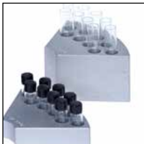
Vial and Test Tube Blocks