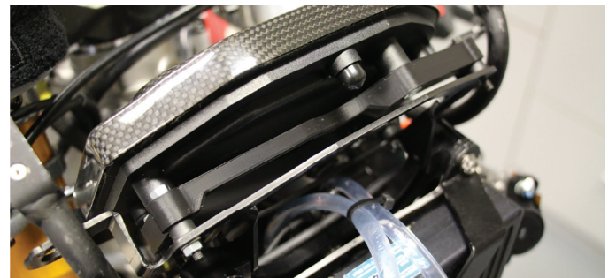
The spacer as it is located in the dashboard.

BASF Ultrafuse ABS+ Fusion Easy. Versatile. Functional.