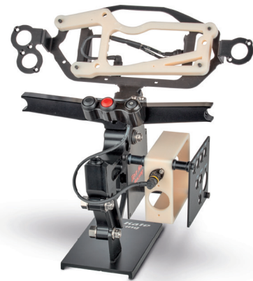
The printed parts: dash board spacer and junction box housing. Printed in contrasting colours for clear distinction.