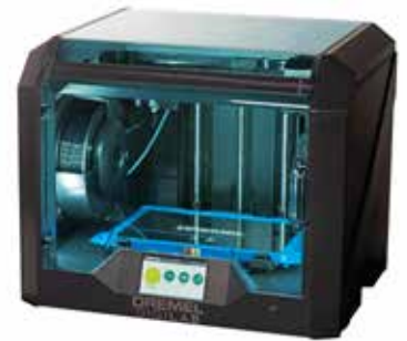
3D45 Starting at $1,999