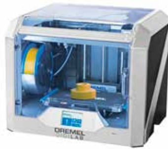
3D40 FLEX Starting at $1,499

Also available as EDU-Bundles (see page 7)