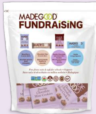
Double Chocolate Soft Baked Mini Cookies