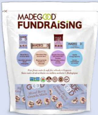
Mixed Berry Granola Minis