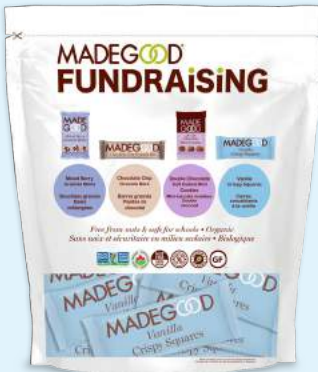
Vanilla Crispy Squares