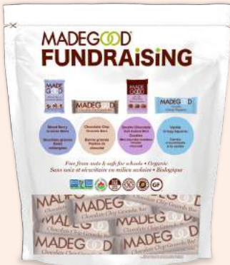
Chocolate Chip Granola Bars