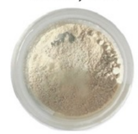
Magnafolate® PRO Type C - Crystalline Calcium L-5-Methylfolate