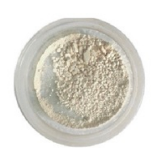
Type I - Crystalline Calcium Salt L-5-Methylfolate