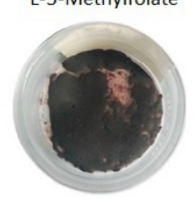
Amorphous Glucosamine Salt L-5-Methylfolate