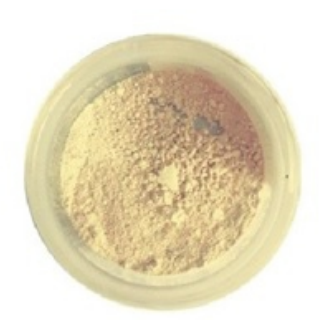
Amorphous Calcium Salt L-5-Methylfolate