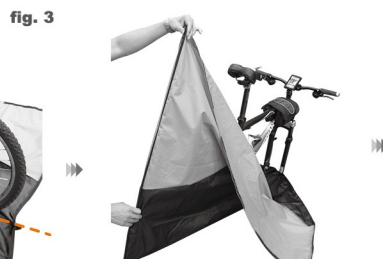
Zip up rear end of bag (fig. 3).