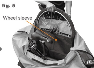
Place front wheel in wheel sleeve (fig. 5).