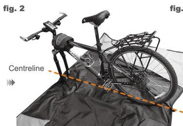
Remove front wheel and stand bike on centreline (fig. 2).