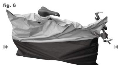
Close velcro along top to seal bag (fig. 6).