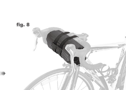
To carry bag on bike, fold neatly, place in carry bag. Attach tightly to handlebars with strap attachments (fig. 8).