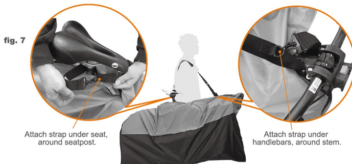
Attach strap under seat, around seatpost.