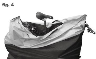
Zip up front end of bag (fig. 4).