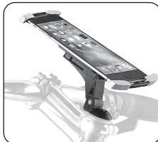
Phone case mounted on stem (Q5 StemClamp)