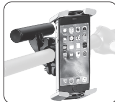
Phone case & Minibar mounted on handlebars (Q6 BarClamp)