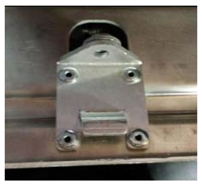
3. Place new bracket provided in the stock location. Place two steel rivets into the stock holes, then mark where to drill remaining two. Drill into the aluminum shelf and install rivets.