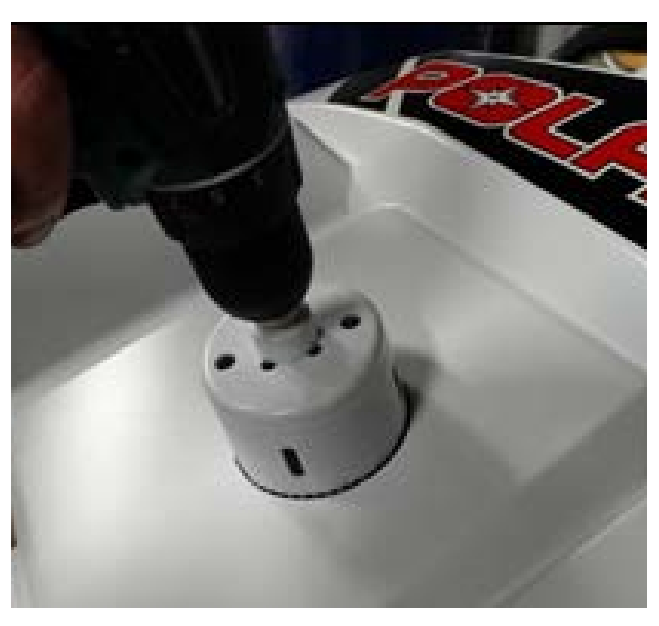
10. Drill a pilot hole in the center of the X, then using a 3" hole saw, drill a hole.