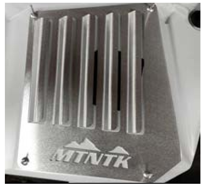
11. Install the vent plate to match body lines of the panel. Mark first, then drill and install the four aluminum expanding rivets as shown.