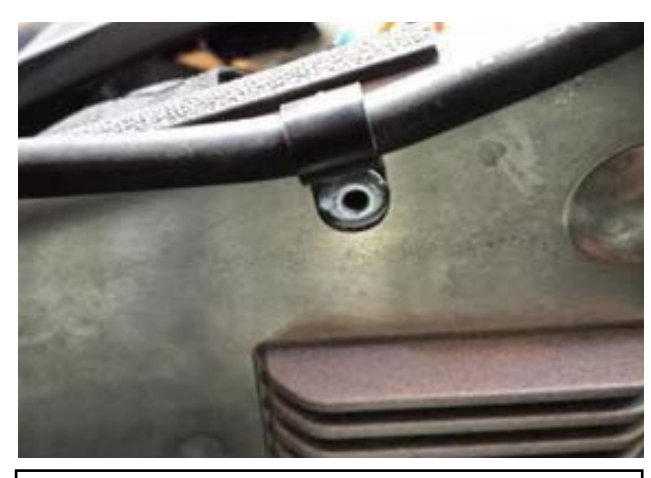
6. Place wire holder onto the Blow Hole wire then rivet into place as shown.