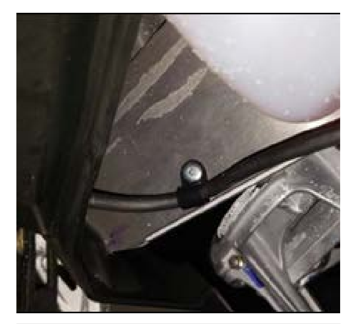
5. Drill a 3/16" hole in the aluminum shelf measuring 3" back from the front of the shelf.