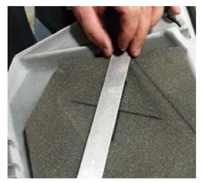
9. Using a straight edge, draw a line from corner to corner within the imprint shown.