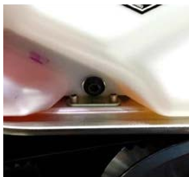
Start by removing the left hand side panel. Remove the oil tank retaining bolt. Save the flat washer and discard the bolt.