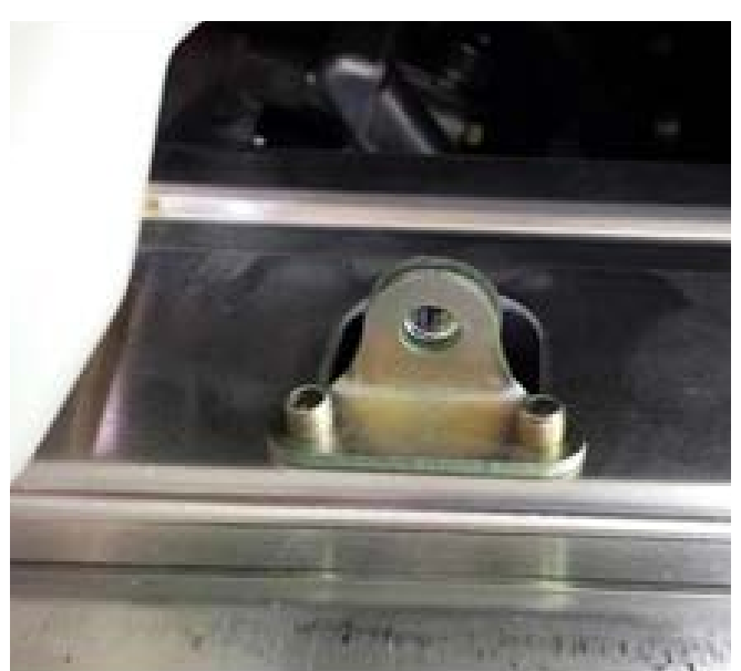
2. Using a 3/16" drill bit, carefully remove the rivets and bracket and discard both. CAUTION: DO NO PUNCTURE THE OIL TANK.