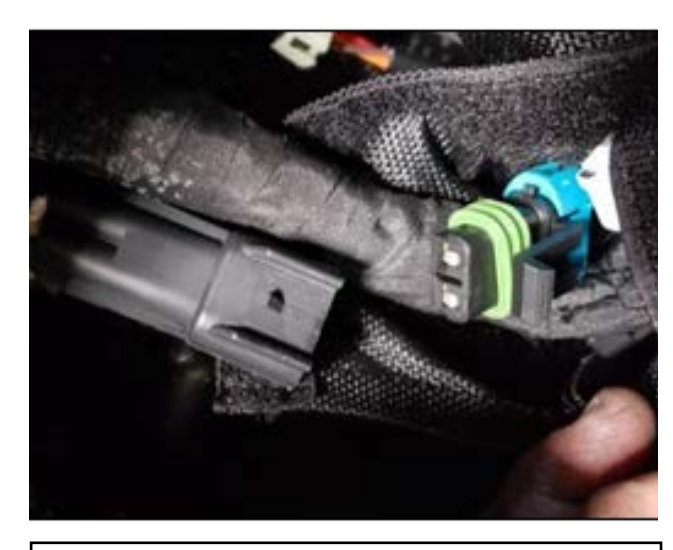
7. Route harness up the frame to harness bag under the center console. Locate plug cap labeled RCA ACCY POWER. Remove cap and plug Blow Hole into Accy Plug as shown.