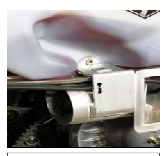
8. Mount Blow Hole as shown. Install side panel and remove outer graphic from panel. Wait for imprint to appear in panel foam. This will be a guide to drill out the outlet for the Blow Hole.