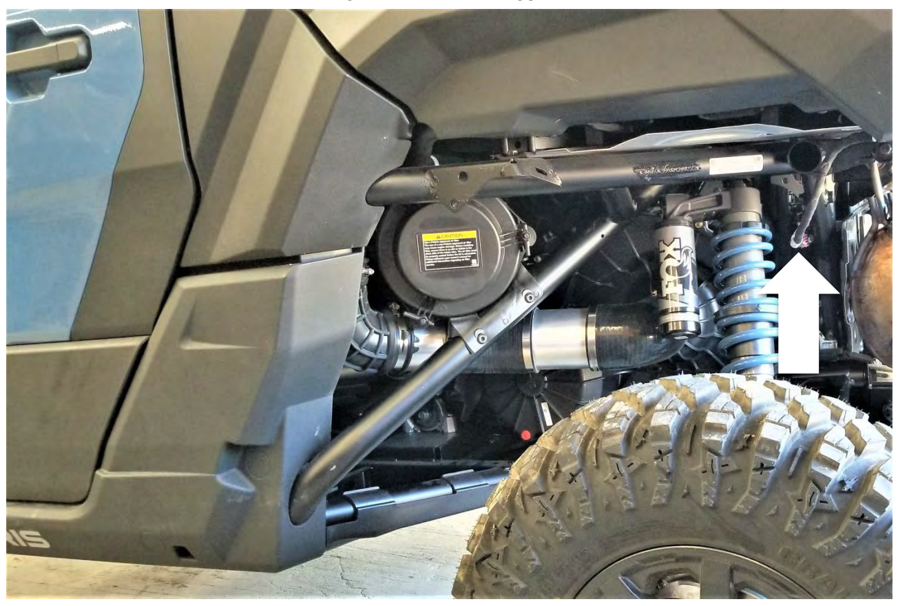
THE BACK LEFT HAND REAR CORNER.

THE ARROW IN THE PICTURE ABOVE IS POINTING TO THE LOCATION OF THE STOCK ELECTRICAL CONNECTOR WHERE THE BLOWHOLE WILL BE PLUGGED INTO.