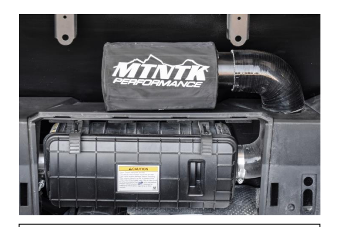
8. Install Pre-Filter as shown with MTNTK Logo facing out. Center the housing between cage tabs above the Pre-Filter. Secure all screws and clamps. Be sure you have removed rag from air box. Reinstall bed access panel.

Disclaimer: All MTNTK Performance Products are designed to offer unmatched reliability and dependability while adding horsepower and performance. They do not however offer any sort of gains from engines or machines that have preexisting problems or conditions. MTNTK Performance is not liable for any malfunctions, mishaps, engine problems, or any other unforeseen problems that may occur after purchasing this or any other MTNTK Performance Product.