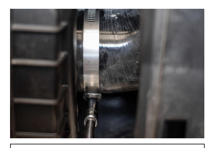
7. Tighten stock clamp on air box and silicone. Make sure everything fits. This may require turning and adjusting the silicone to fit, depending on accessories.