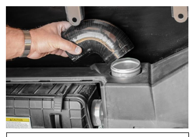
6. Place the aluminum tube inside one of the 90° silicone. Install on air box with aluminum tube showing outside of the hole. Place remaining silicone on aluminum tube as shown.