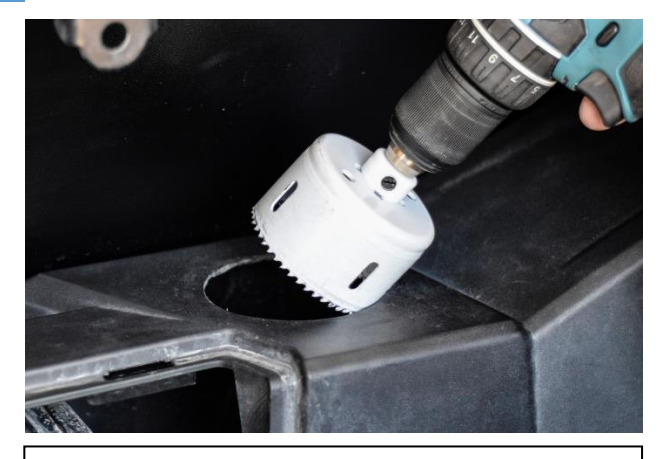
5. Using a 3 ½" Hole Saw, cut the access hole as shown through the plastic console. Deburr the edges and clean all plastic shavings from inside console. Install plastic console back in place.