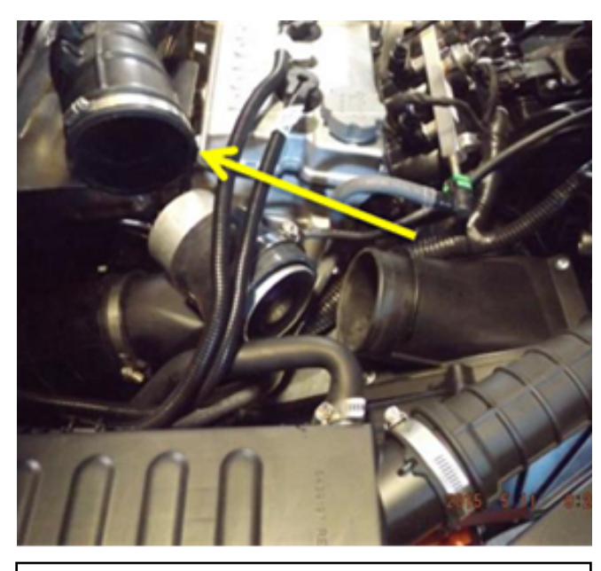
3. Separate the exhaust hose from the clutch housing.