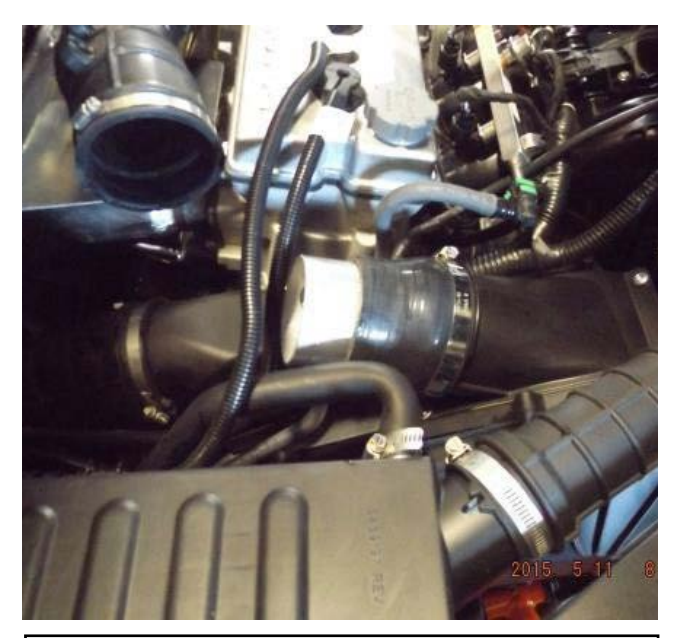
4. Now install Blow Hole onto clutch housing as shown. Tighten clamp.

2. Loosen the clamp on the clutch exhaust hose.