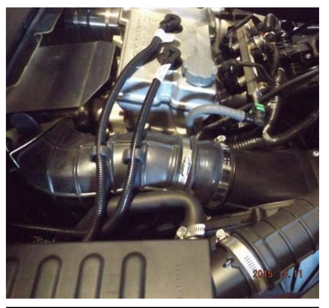
5. Then install exhaust hose onto Blow Hole assembly. Tighten clamp.