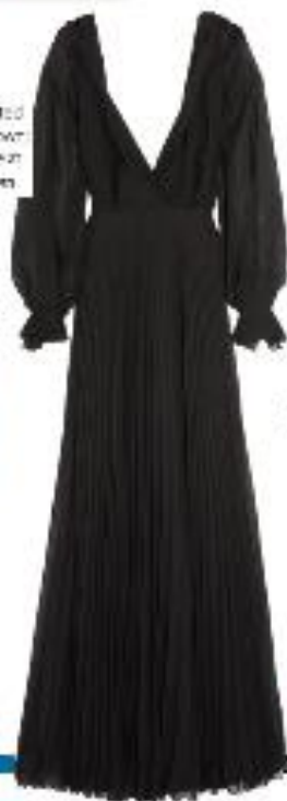
VICTORIA BECKHAM Puffed Sleeves and Floor $1500 Available at victoriabeckham.com