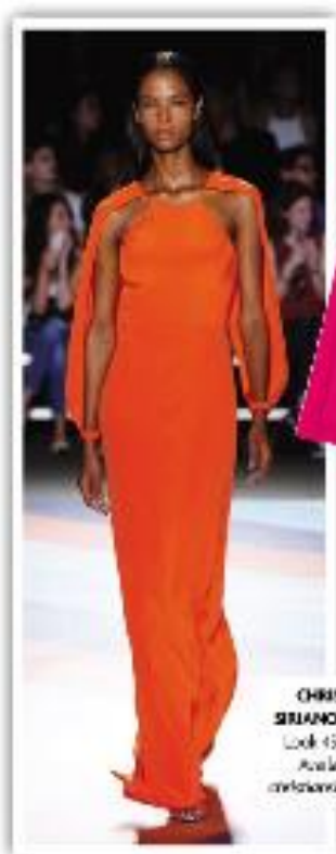
CHRISTIAN SIRIANO Spring '17 Look 45 $3800 Available at cristianosiriano.com