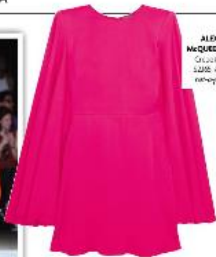
ALEXANDER MCQUEEN Open-back Gown $1650 Dress $2300 Available at alex-mcqueen.com