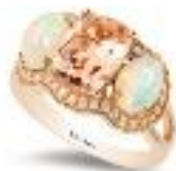
LEVIAN Halo Snow- berry Gold Ring with 2.54 Total Carat Weight Pear Marquise and Round-cut Opal and 0.18 Total Carat Weight Vanilla Diamonds $7,040 Available at levian.com