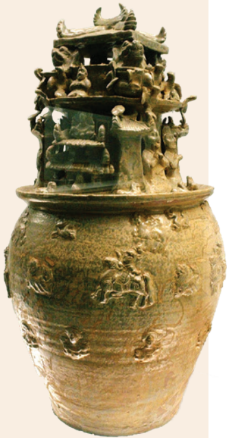
▲ Funeral urn from the Western Jin dynasty