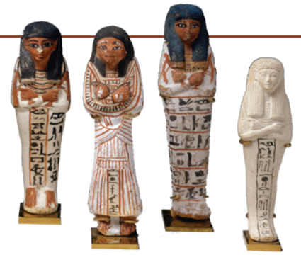
▲ Carved figures found in an Egyptian tomb