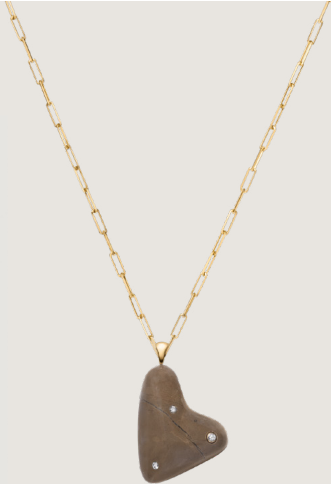
From raw to refined.