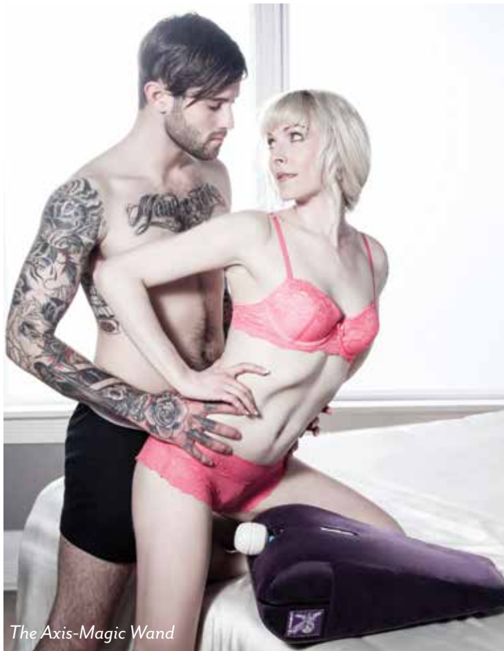
The Axis-Magic Wand

CREATE YOUR PLAYGROUND Love your toy, but want more? Liberator's toy mounts give you the incredible option of getting more pleasure out of your favorite vibes and dildos by providing a soft, supportive cushion to house your toy while the ergonomic designs help you receive stimulation and vibrations in a whole new way.