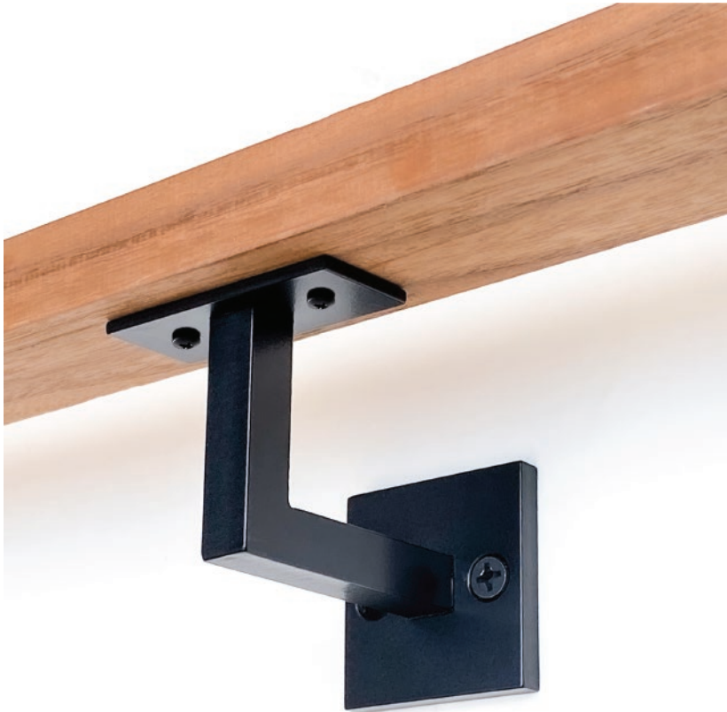
Minimal Handrail Bracket