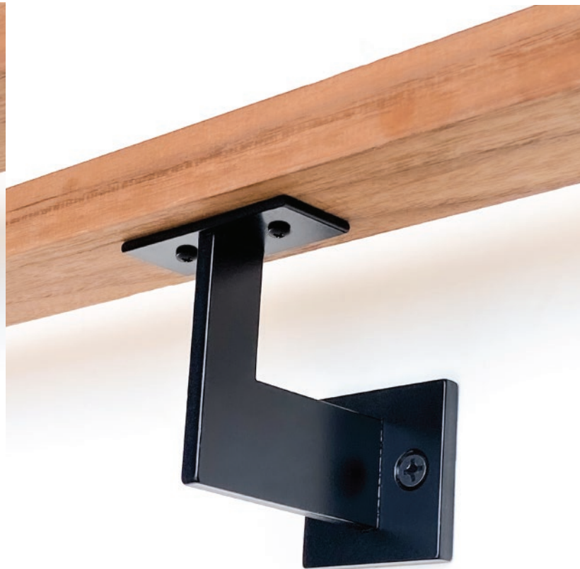
Linear Handrail Bracket