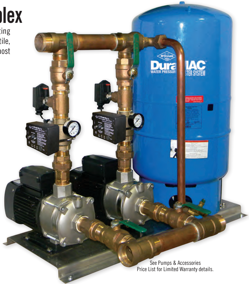
See Pumps & Accessories Price List for Limited Warranty details.