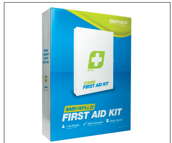
Durable, high impact packaging for point of sale