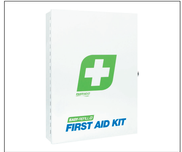
Premium quality large wall mountable metal cabinet