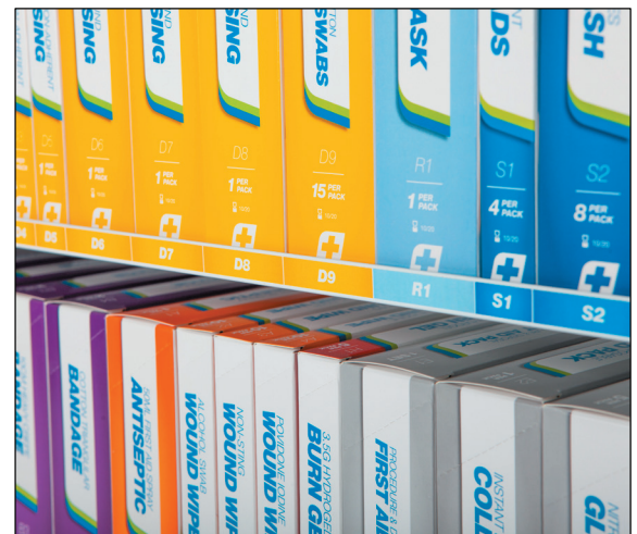
Highly visible colour coded consumables for easy identification in emergencies