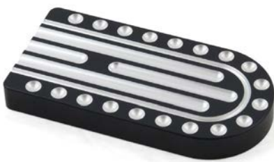
Large Brake Pedal, Black Machine 86-up