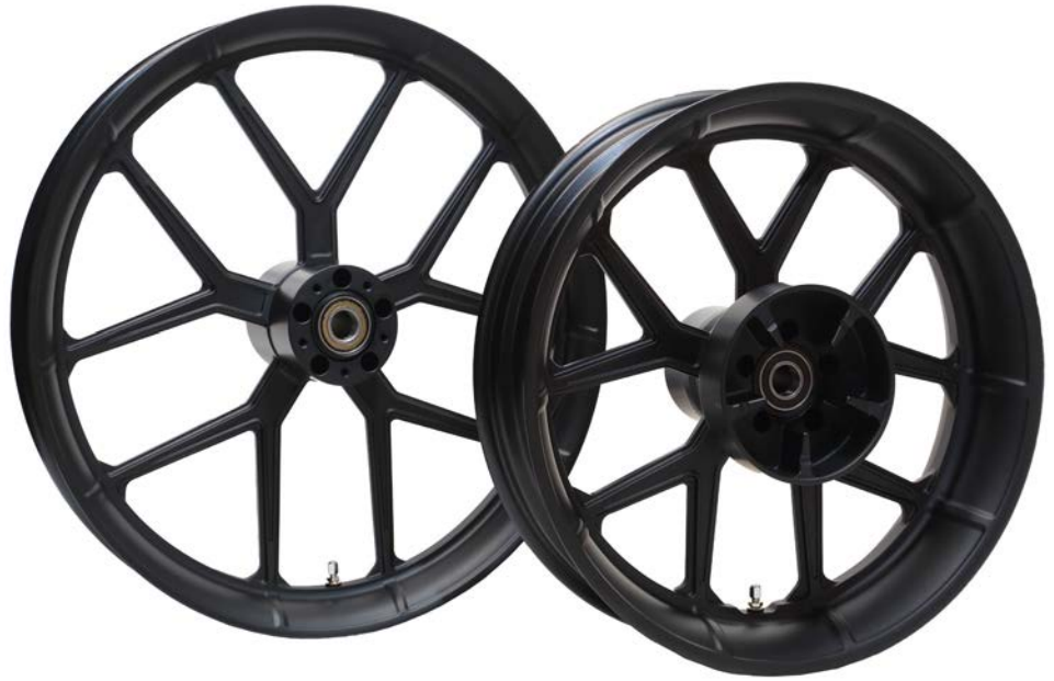
Spider Wheel In Flat Black