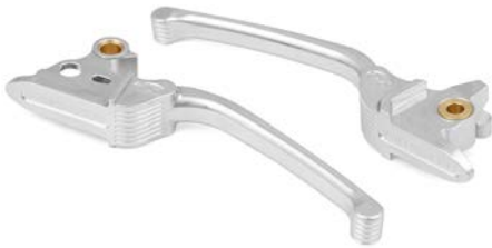
Neo Fusion Lever set Polished 2015 up Softail Model(ex CVOmodel) 2-503