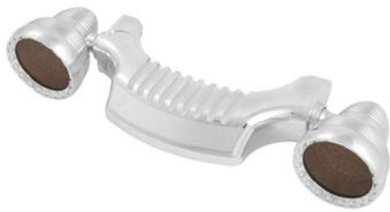
Neo-Fusion Bagger Combo Taillight Polished 11-301