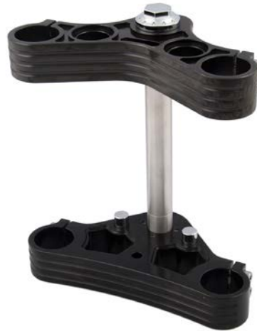
39mm Tripel Tree Black