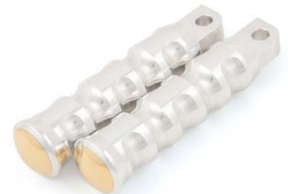
Neo-Fusion Pegs, Polished Brass Cap 5-020