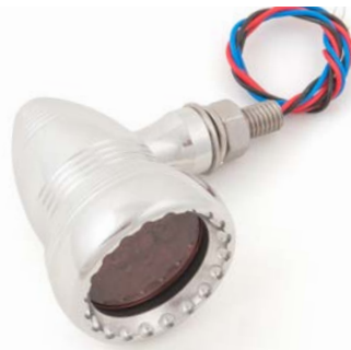
Neo-Fusion Marker Polished w/Polished Ring* 11-012