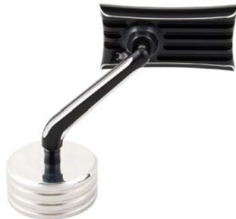
Ribbed Mirror, Black Machine, Left 12-210