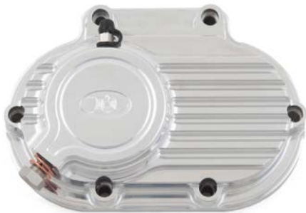
Trans Side Cover, Hydraulic, 2006 Up TC96, Polished 10-300