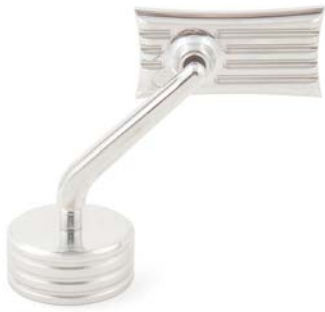
Ribbed Mirror, Polished, Left 12-208