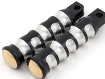
Neo-Fusion Pegs, Black Machine Brass Cap 5-018