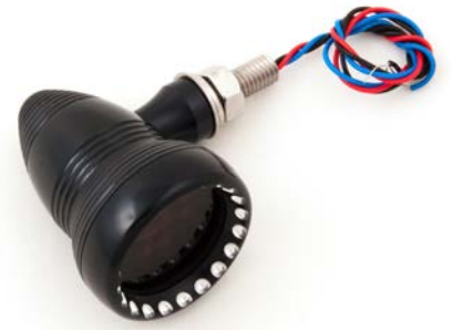
Neo-Fusion Marker Black w/Black Machine Ring* 11-010