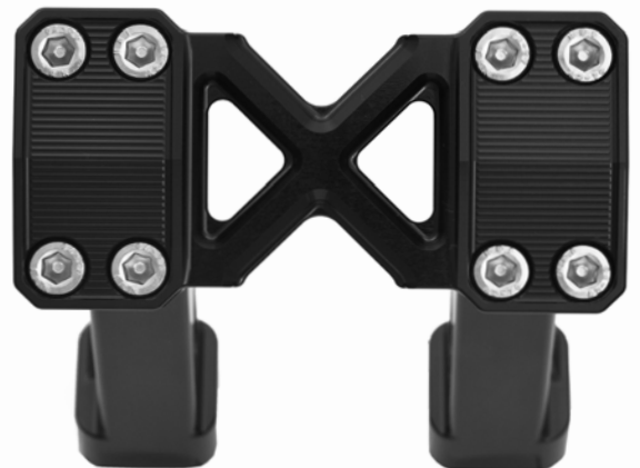
X riser Top Clamp