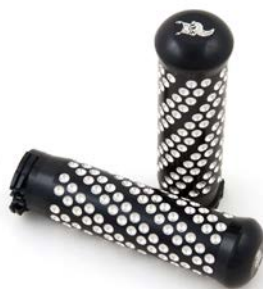
Spiral Grips, Black Machine 1-005