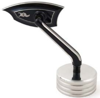
Vanquish Mirror Black Machine, Right 12-203