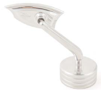
Vanquish Mirror, Polished, Right 12-201