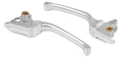
Neo Fusion Lever set Polished 2008~2013 Touring Model(ex CVO) 2-505