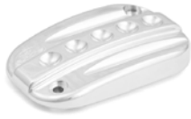
Neo-Fusion Front Master Cylinder Cover, Polished, 08-17 FLT, 06-11 V-Rod, 09-13 Trike 20-100