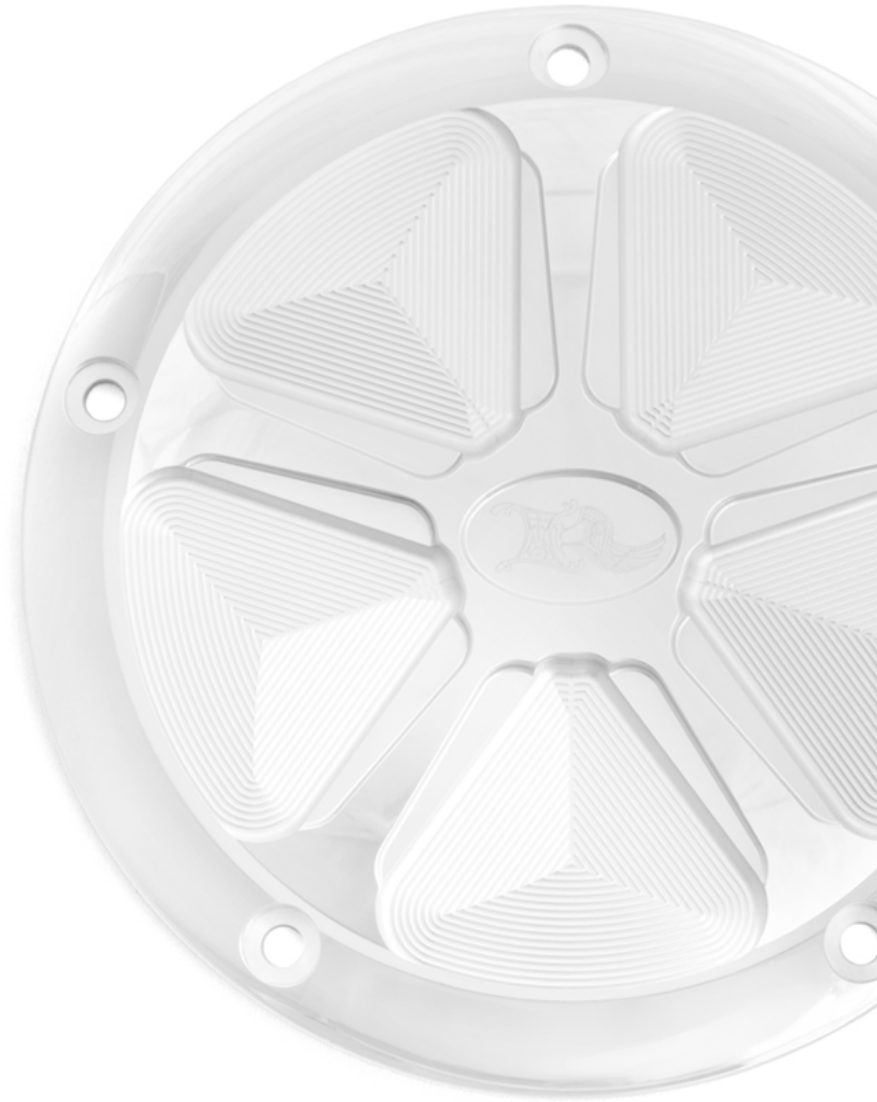
5-Spoke Derby Cover, 5-Hole, Polished 8-922