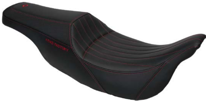
Next Level Two-Up seat Red Stitch 2008 and up Touring KFS-01R