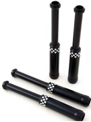
Billet Pushrod Covers, TC Black Machine 7-001