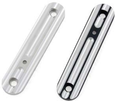
Marker Light Holder