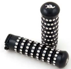
Ribbed Grips, Black Machine 1-006