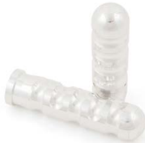
Neo-Fusion Classic Grips, Polished 08 up (throttle by wire) 1-013