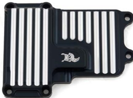
Trans Top Cover, 06 Up TC96, 6speed Black Machine 10-201