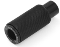
Next Level Shifter Peg Rubber KFP-03