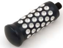
Dimpled Shifter Peg, Black Machine 5-006