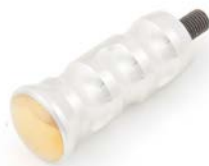
Neo-Fusion Shifter Peg, Polished Brass Cap 5-027