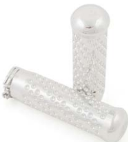
Spiral Grips, Polished 1-001