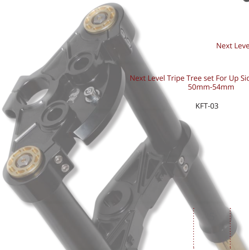
Next Level Tripe Tree set For Up Side Down fork 50mm-54mm