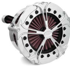
Reverse Cone 5-Spoke, Chromed Milwaukee-Eight 6-306