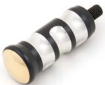
Neo-Fusion Shifter Peg Black Machine, Brass Cap 5-026

Over a dozen more styles to choose from and growing. Visit Kens-Factory.com for images and pricing.