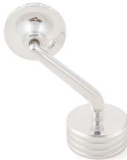
Classic Mirror Polished, Right 12-205