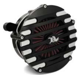
Reverse Cone Ribbed, Black Machine Milwaukee-Eight 6-317