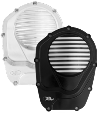
Vanquish Cam Cover, Black Machine Milwaukee-Eight 8-105 Black Machine 8-107 Polished