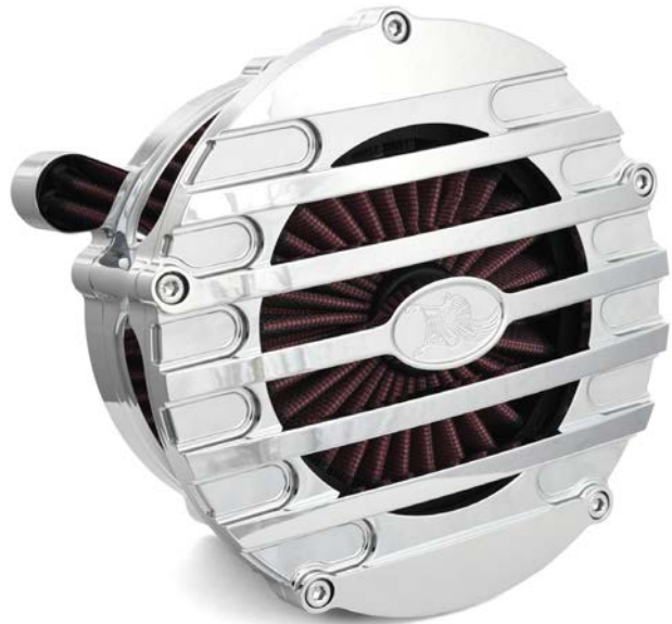
Reverse Cone Ribbed TBW Chromed 6-309