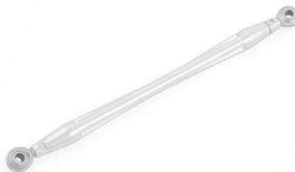
Pointed Shifter Rod, Polished 12-402