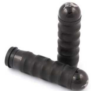
Neo-Fusion Rubber Grips, Black 08 up (throttle by wire) 1-011