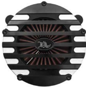
Reverse Cone Ribbed TBW Black Machine 6-302