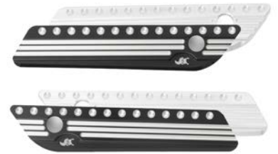
Saddle Bag Latches, 2014-Up