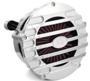
Reverse Cone Ribbed, Chromed Milwaukee-Eight 6-315