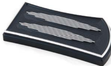
Neo-Fusion Brake Pedal, Black Machine, Touring