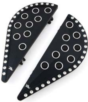
Floor Boards, Black Machine 86 up 5-101