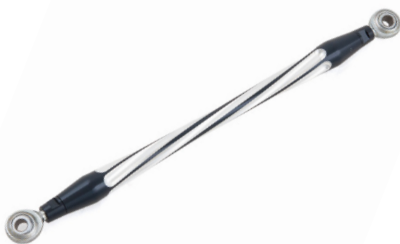
Spiral Shifter Rod, Black Machine 12-401