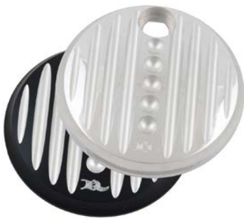
Gas Cap Cover 08 up FL