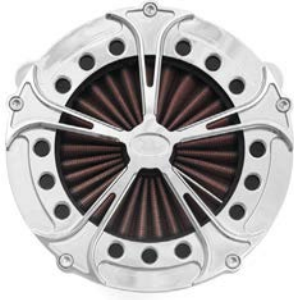
Reverse Cone 5-Spoke TBW Polished 6-304