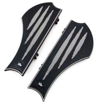
Neo-Fusion Floor Boards Black Machine 5-200