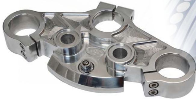
Next Level Top Tree for 2014 up Touring model Polished KFT-01P