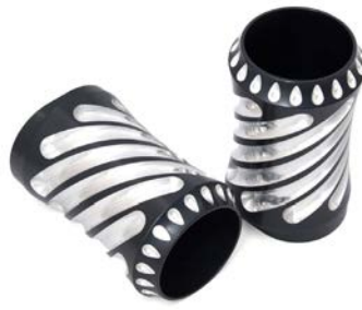
Spiral Fork Boot Cover, 49mm Black Machine