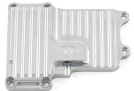
Trans Top Cover, 06 Up TC96 6speed, Polished 10-200