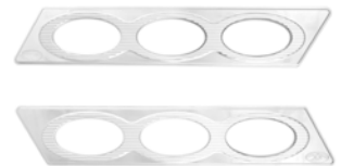
Saddle Bag Guard Polished