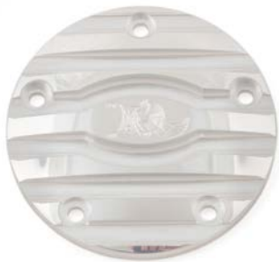
Ribbed Points Cover, 5-Hole Polished