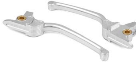
Neo Fusion Lever set Polished 2017 up Touring Model 2-501