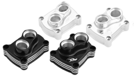
Lifter Blocks Milwaukee-Eight 8-403 Black Machine 8-405 Polished