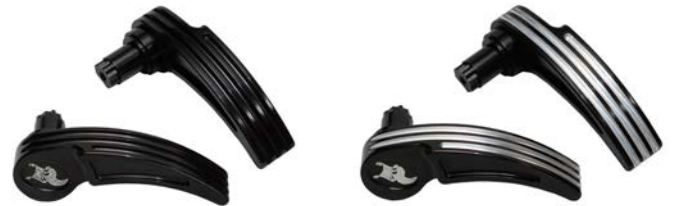
Next Level Saddle Bag Lever 2014 and up Touring KFL-01 Next Level Saddle Bag Lever 2014 and up Touring KFL-01