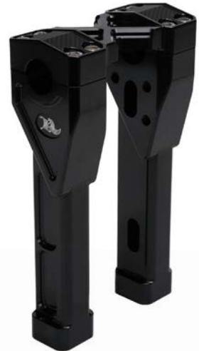
Nex Lwvel X riser 8" Straight Black