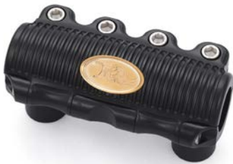
Neo-Fusion One Piece Riser Clamp, Black