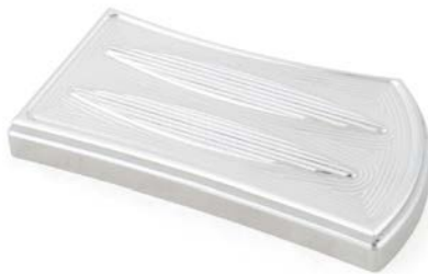
Neo-Fusion Brake Pedal Polished, Touring