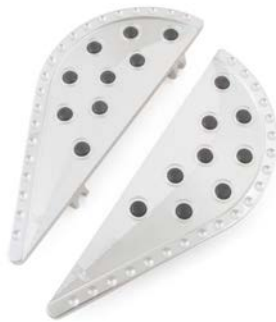
Floor Boards, Polished 86 up 5-105