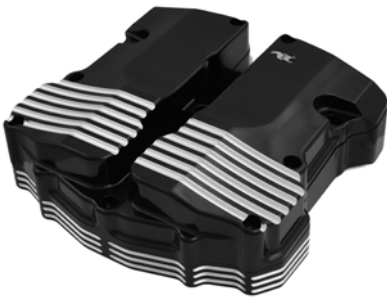
Vanquish Rocker Covers, Black Machine, Milwaukee-Eight 8-300