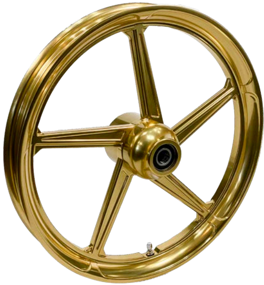
Slant 5 In Gold Anadized