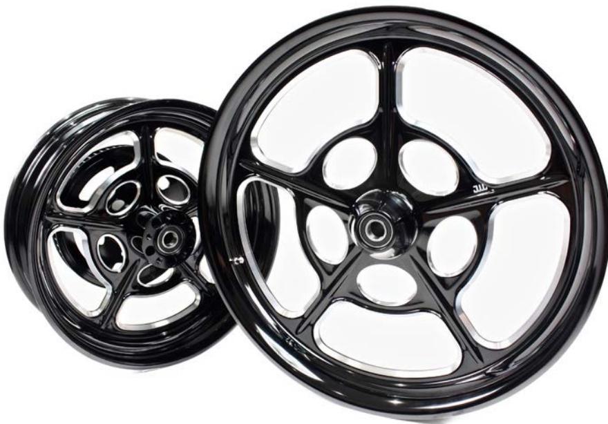
El Mirage Wheel Black/Machine