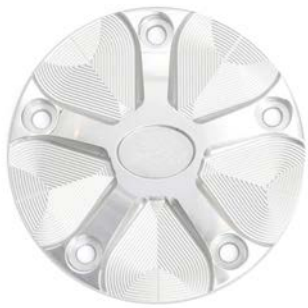
5-Spoke Points Cover Polished