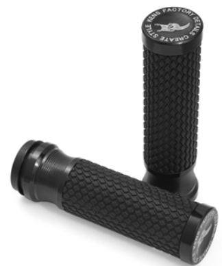
Next level Block Rubber Grips KFG-02