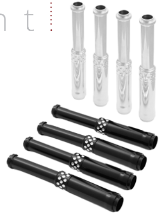
Billet Pushrod Cover Milwaukee-Eight 7-007 Black Machine 7-008 Polished