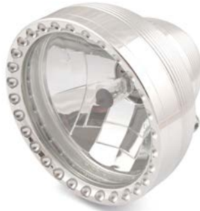
Neo-Fusion Headlight, 5-3/4" Polished 11-201