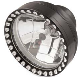
Neo-Fusion Headlight, 5-3/4" Black Machine 11-200