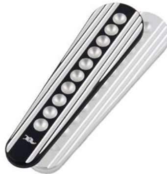
Tank Panel, Lower 09 up FL