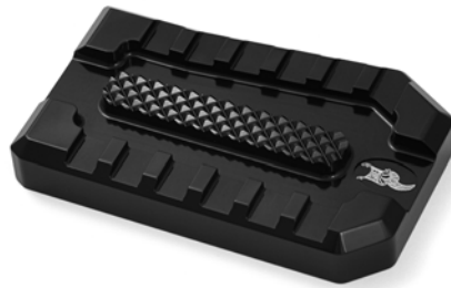
Next Level Brake Pedal Black, Touring