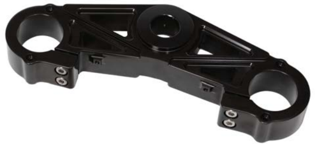
Next Level Lower Tree for 2014 up Touring model Black KFT-02