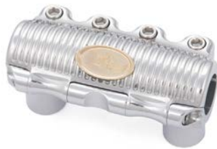
Neo-Fusion One Piece Riser Clamp Polished