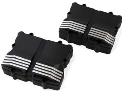
Vanquish Rocker Covers, TC Black Machine 8-102