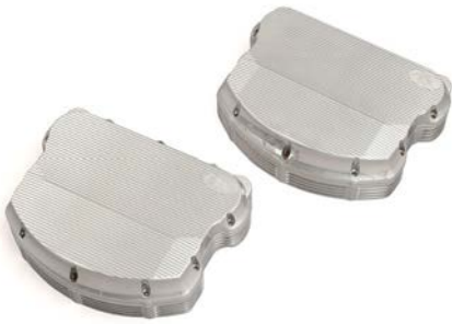
Neo-Fusion Rocker Covers Touring TC, Polished 8-202