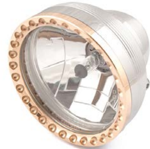
Neo-Fusion Headlight, 5-3/4" w/ Polished, Brass Ring 11-205