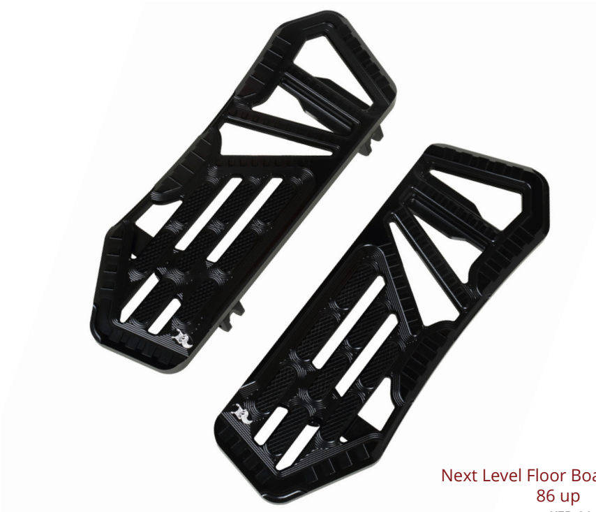
Next Level Floor Boards, Black 86 up KFB-01