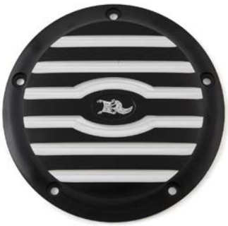
Ribbed Derby Cover, 5-Hole Black Machine 8-921