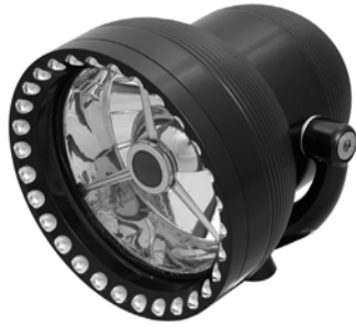
Neo-Fusion Headlight, 4-1/2" Black Machine 11-002