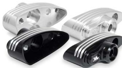
Marker Light Holder 2014-Up TRX