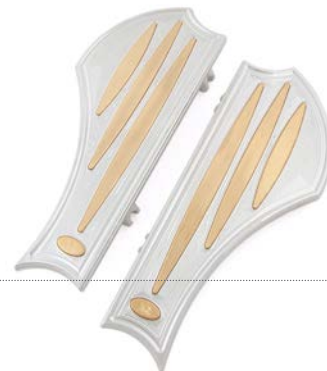
Neo-Fusion Floor Boards, Polished Brass Insert 5-204