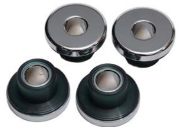
Riser Bushing 2008 and up Touring