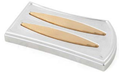
Neo-Fusion Brake Pedal, Polished, Brass Insert, Touring