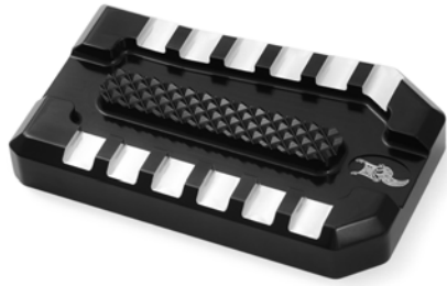
Next Level Brake Pedal Black/Machine , Touring