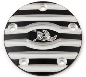
Ribbed Points Cover, 5-Hole Black Machine