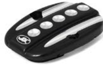
Neo-Fusion Rear Master Cylinder Cover, Black Machine, 08-17 FLT 20-103