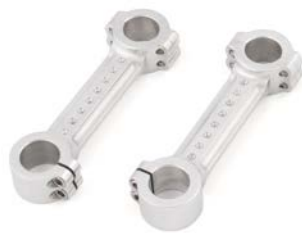
Billet Dog Bone Riser, Set, Polished