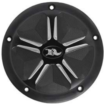
5-Spoke Derby Cover, 5-Hole Black Machine 8-923