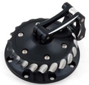
Neo-Fusion Gas Cap, Black Machine 12-101 *Custom Fitment, Weld In Bungs