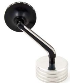
Classic Mirror Black Machine, Right 12-207