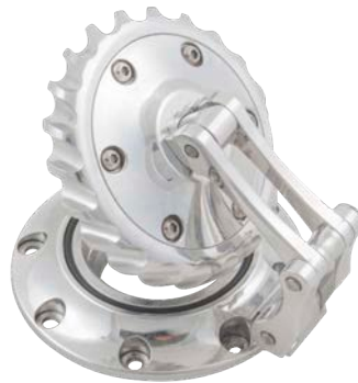
Neo-Fusion Gas Cap, Polished 12-100 *Custom Fitment, Weld In Bungs