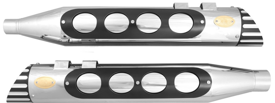
Chrome Slip-On Muffler, Set, w/BlackMachine Cap for Milwaukee-Eight

Go check www.kens-factory.com Exhaust section