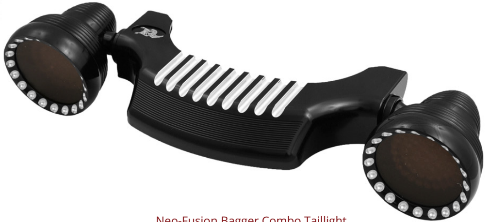
Neo-Fusion Bagger Combo Taillight Black Machine 11-300