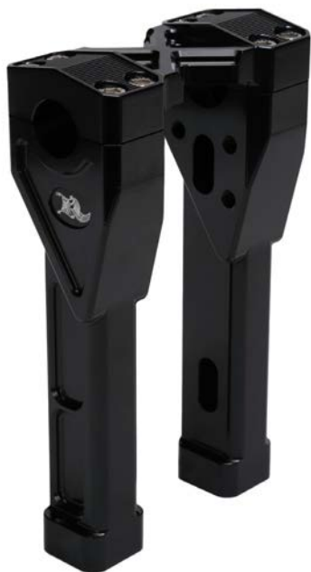
Next level X Riser 8" straight KFR-01