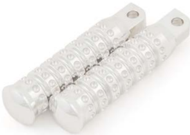
Ribbed Pegs, Polished 5-008