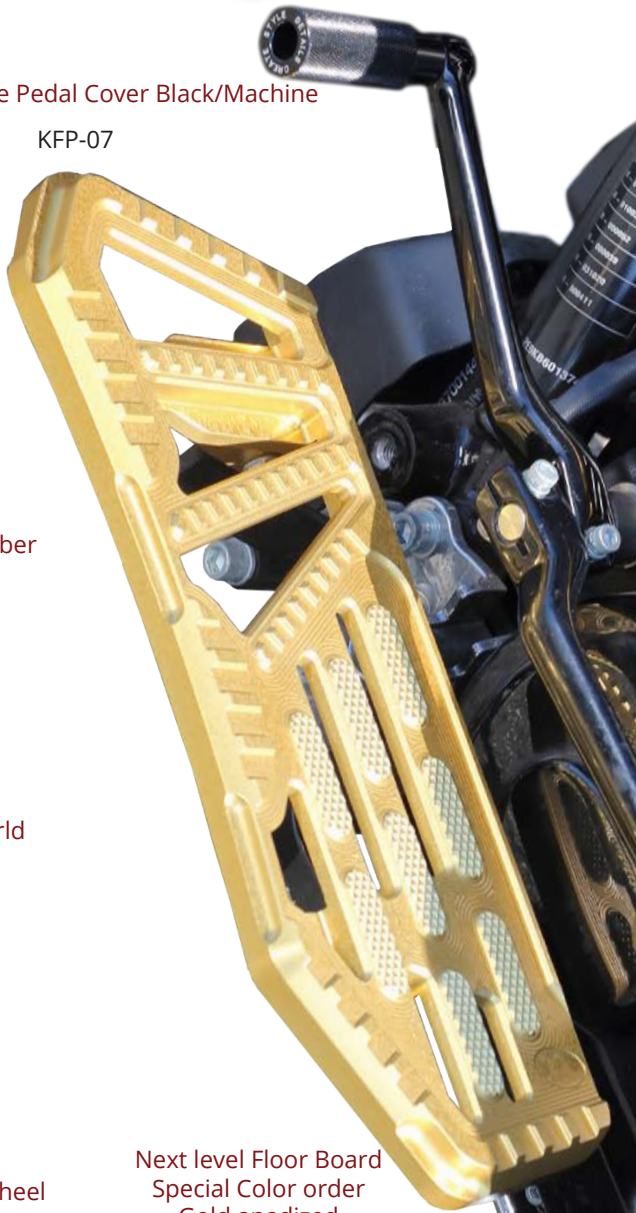
Next level Floor Board Special Color order Gold anadized Blue anadized Red anadized Avilable