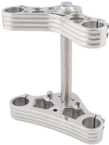
39mm Triple Tree Polished.

Special Tree for Performance Bagger Build. For 2014 up touring model Fits 50mm top 54mm bottom. Fits Race Tech G6 fork or simmiler KFT-03