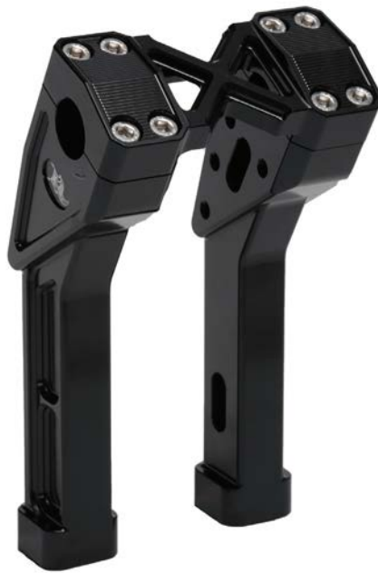
Next level X Riser 8" Bent KFR-02