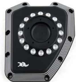
Neo-Fusion Cam Cover, TC Black Machine 8-003