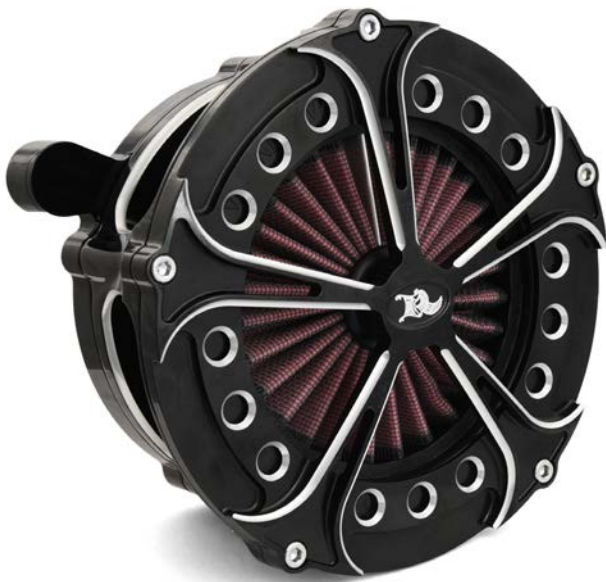
Reverse Cone 5-Spoke TBW Black Machine 6-305