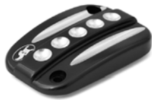
Neo-Fusion Clutch Master Cylinder Cover, Black Machine, 14-16 FLT 20-105