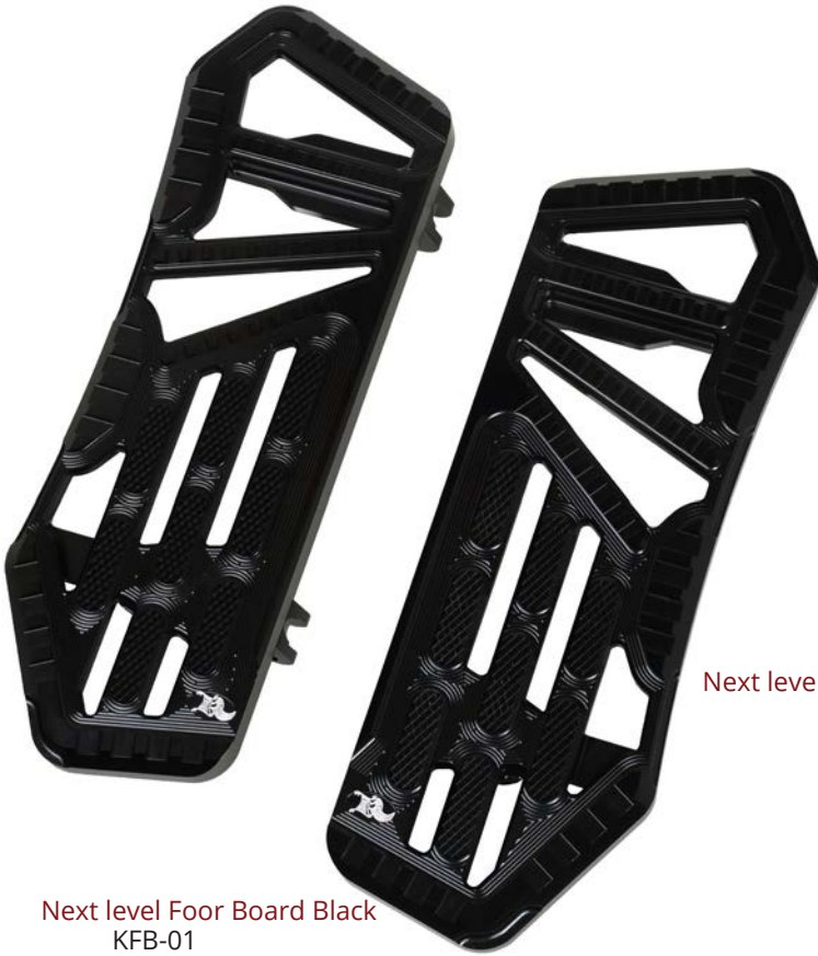
Next level Foot Board Black KFB-01