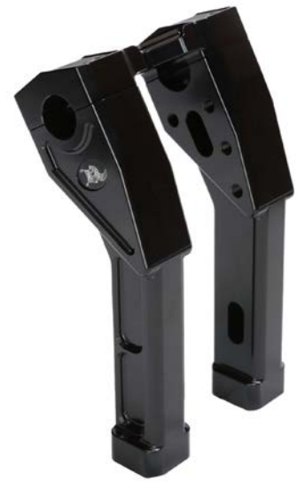
Nex Lwvel X riser 8" Bent Black