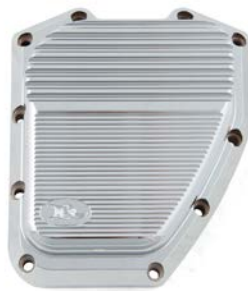
Vanquish Cam Cover, TC Polished 8-103