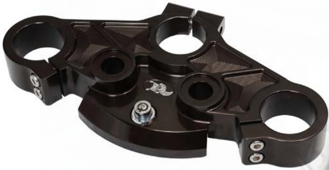
Next Level Top Tree for 2014 up Touring model Black KFT-01B