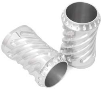
Spiral Fork Boot Cover, 49mm Polished