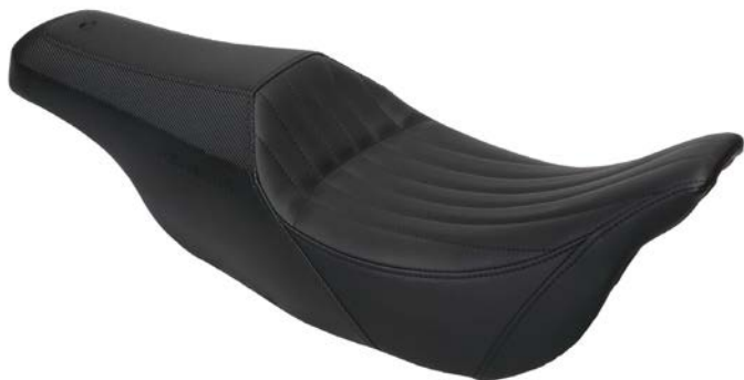
Next Level Two-Up seat Black Stitch 2008 and up Touring KFS-01B