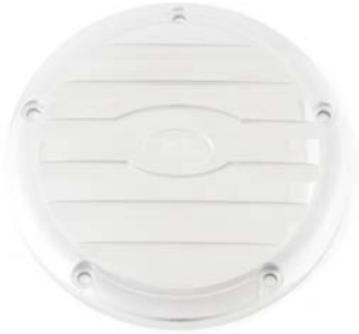
Ribbed Derby Cover, 5-Hole, Polished 8-920