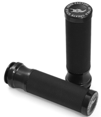
Next level Fine Rubber Grips KFG-01