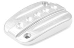
Neo-Fusion Clutch Master Cylinder Cover, Polished, 2017-Up FLT 20-106