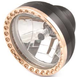
Neo-Fusion Headlight, 5-3/4" Black, Brass Ring 11-200