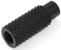
Next Level Shifter Peg Knurled KFP-02