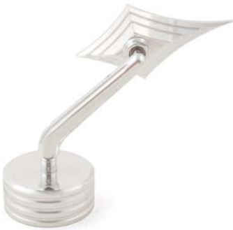
Pointed Mirror, Polished, Left 12-212