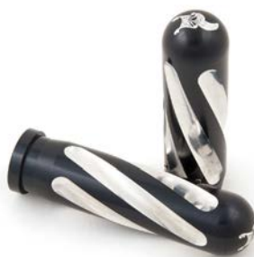
Neo-Fusion Spiral Grips, Black Machine 08 up (throttle by wire) 1-014