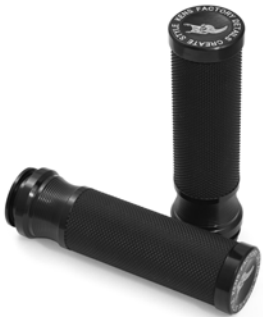
Next Level Fine Rubber Grips ,Black KFG-01