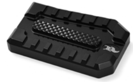
Next level Brake Pedal Cover KFP-06