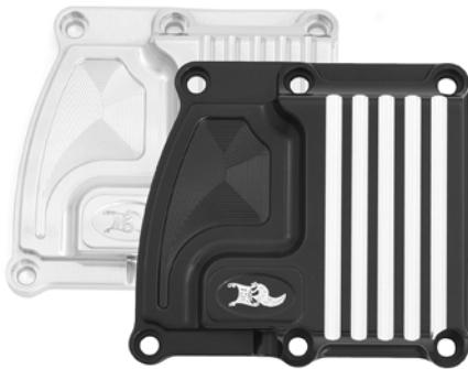
Trans Top Cover Milwaukee-Eight 10-202 Black Machine 10-204 Polished