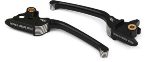
Neo Fusion Lever set Black/Machine 2015 up Softail Model(ex CVOmodel) 2-502