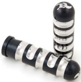
Neo-Fusion Classic Grips, Black Machine 08 up (throttle by wire) 1-012