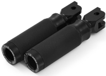
Next Level Pegs Milwaukee Eight KFP-04