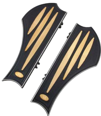
Neo-Fusion Floor Boards, Black Machine, Brass Insert 5-203