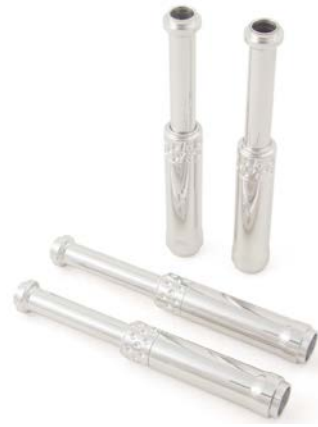
Billet Pushrod Covers, TC Polished 7-002