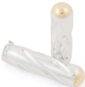
Neo-Fusion Spiral Grips Polished/Brass 1-011