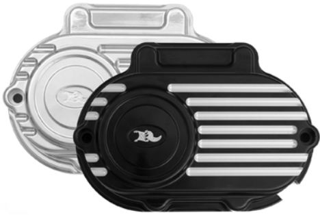
Hydraulic Clutch Cover Shell Milwaukee-Eight 10-404 Polished / 10-402 Black Machine