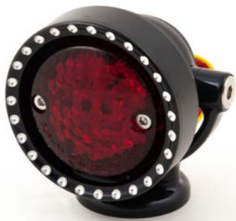
Neo-Fusion Taillight, Black Machine 11-006