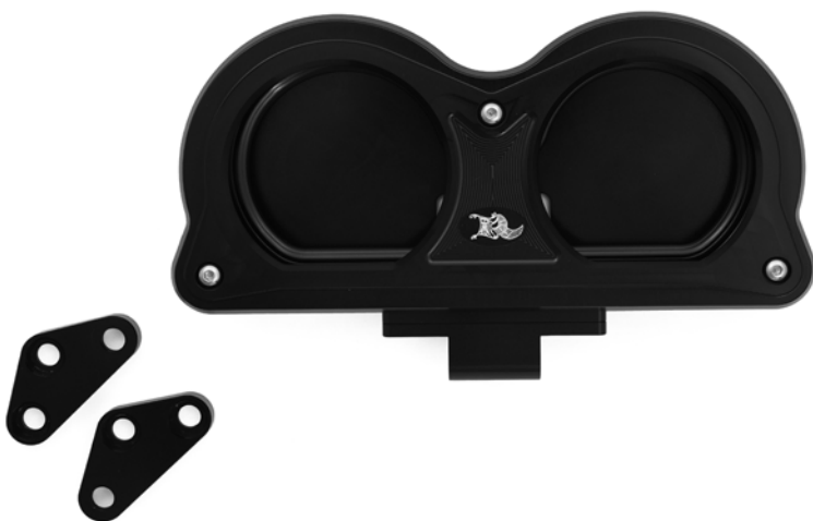
Next level Gauge Relocate kit KFH-01