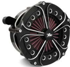
Reverse Cone 5-Spoke, Black Machine Milwaukee-Eight 6-308