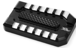
Next level Brake Pedal Cover Black/Machine KFP-07