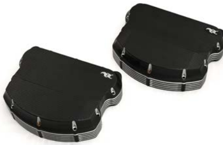
Neo-Fusion Rocker Covers, TC Touring Black Machine 8-201