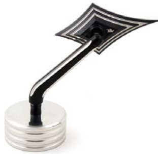
Pointed Mirror, Black Machine, Left 12-214