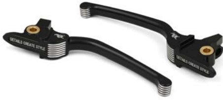
Neo Fusion Lever set Black/Machine 2017 up Touring Model 2-500