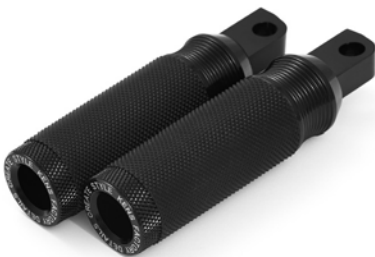
Next level Foot Peg KFP-05