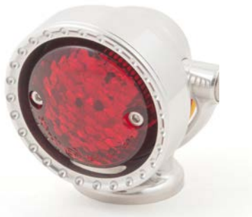
Neo-Fusion Taillight, Polished 11-008