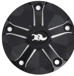
5-Spoke Points Cover Black Machine