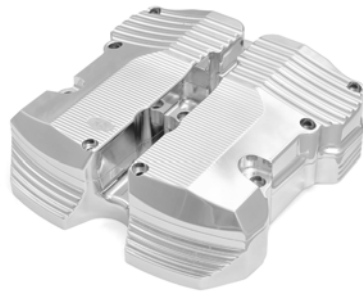
Vanquish Rocker Covers, Polished Milwaukee-Eight 8-302