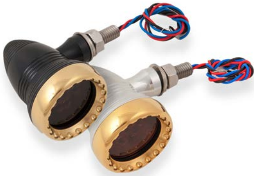
Neo-Fusion Marker Brass Ring* 11-009 Black / 11-011 Polished