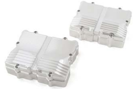
Vanquish Rocker Covers, TC Polished 8-101