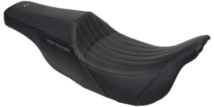
Next Level Two-Up seat Gray Stitch 2008 and up Touring KFS-01G