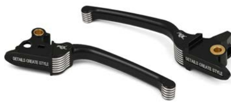
Neo Fusion Lever set Black/Machine 2008~2013 Touring Model(ex CVO Model) 2-504