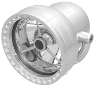
Neo-Fusion Headlight, 4-1/2" Polished w/Polished Ring 11-004