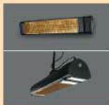
Adjustable wall/ceiling brackets included