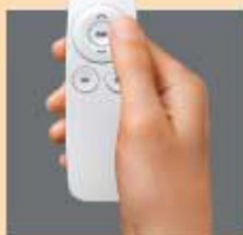
Includes 6 heat-level remote control