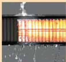
Water resistant IP65 rated

CF Series Heaters employ an advanced carbon fiber emitter technology that generates instant, infrared directional warmth, while limiting the harsh light and glare often associated with infrared heating. It's carbon fiber filaments can generate powerful warmth, but emit only a pleasant, soft, ambient glow. CF Series Heater operation is safe, odorless and silent, with none of the harmful effects of combustion. The heater is constructed of stainless steel and durable aircraft grade aluminium. With an IP65 rating for water and dust resistance, it will operate safely in virtually all weather conditions. CF Series Heaters have been designed for maximum convenience and ease of use, with an easily accessible ON/OFF switch on the unit and a 6 heat-level remote control. Once installed, the heater requires virtually no maintenance. Adjustable mounting brackets for wall and ceiling installation are included. CF Series Heaters are available in 1500W or 3000W models