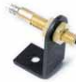
FMB-2 (5.1mm diam.) FMB-3 (3.1mm diam.) Miniature Glass or Plastic Fiberptic Mounting Brackets