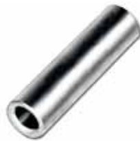
GLA-2 Long Range Lens for Through-Beam Use with M4 Tips