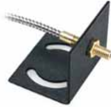
FMB-1 (8.4mm diam.) Standard Fiberptic Mounting Bracket Use with Threaded Glass Fiberptic