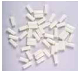
NFA12-50 .25" Nylon Fiberptic Adaptor (50 pieces) Use to adapt UAC-12 Lens to .040" diam. plastic fibers.