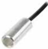
GLA-1 1/4" X 1" Slip-on Lens Assembly Slips on Model EH-4001 plastic fibers