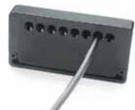
PFC-1 Plastic Fiber Cutter