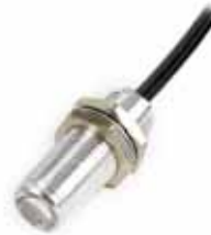
HLA-1 3/8" X 1" Threaded Slip-on Lens Assembly Slips on Model EH-4001 plastic fibers