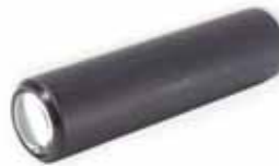
UAC-5 Threaded Spot Focus Plastic Lens, 1" Focal Point Fits any standard threaded tip Glass Fiberptic Lg. 2" (51mm)