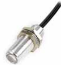
HLA-2 Spot Focus Lens for Diffused Beam Use with M6 Tips Focal Point .50" (12.7mm)