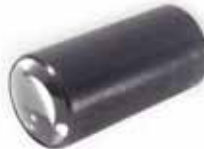
UAC-15 Threaded Long Range Glass Lens, 2" Focal Point Fits any standard threaded tip Glass Fiberptic Lg. 1 3/8" (35mm)