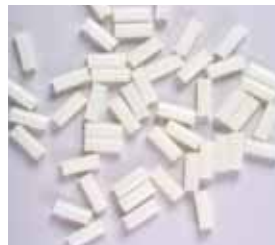
NFA-50 .5" Nylon Fiberptic Adaptor (50 pieces) Use to adapt F1S and F4S optical blocks to all .040" diam. cut-to-length plastic fiberptic light guides.