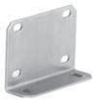
SEB-3 Stainless "L" Bracket