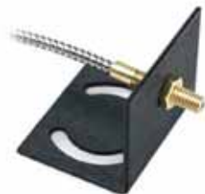
FMB-1 (8.4mm diam.) Standard Fiberoptic Mounting Bracket