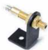
FMB-2 (5.1mm diam.) FMB-3 (3.1mm diam.) Miniature Glass or Plastic Fiberoptic Mounting Brackets