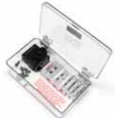
LK-4 Lens Kit (See Optical Blocks Accessories for contents)