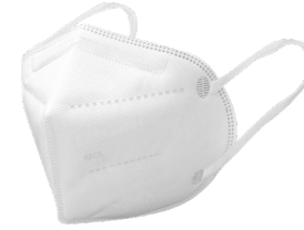
FFP2 5 Layer Masks