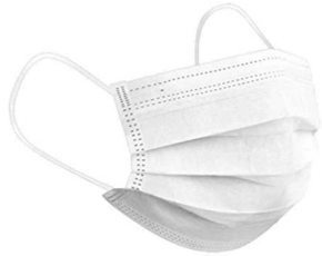
3 Ply IIR Masks