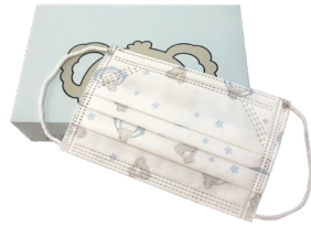
3 Ply Kids Masks