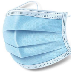
3 Ply Masks