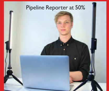
Pipeline Reporter at 50%