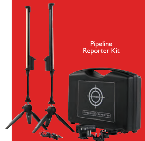
Pipeline Reporter Kit