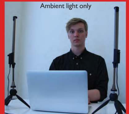
Ambient light only