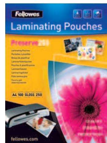
Compatible with Fellowes Preserve 250 micron pouches