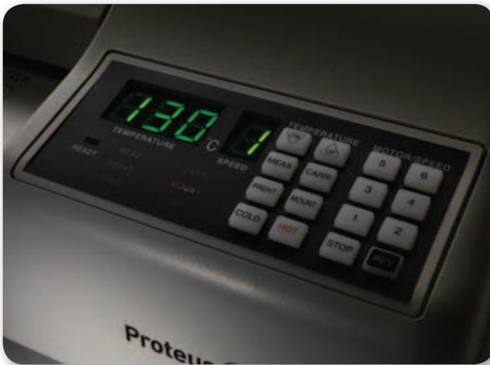
Advanced control panel for flexibility and ease of use