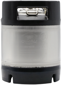
1.75 Gallon Mini-Keg