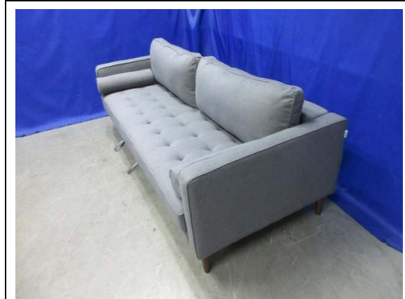
Sample as received - View 2