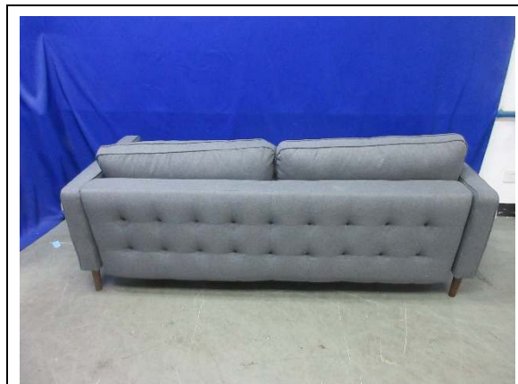
Sample as received - View 4

SGS authenticate the photo on original report only