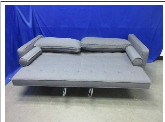
Sample as received - View 3