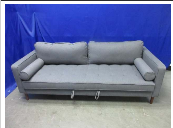
Sample as received - View 1