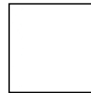
White High Gloss (Upcharge)