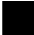
Black High Gloss (Upcharge)