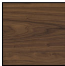
Walnut (Natural Oiled)