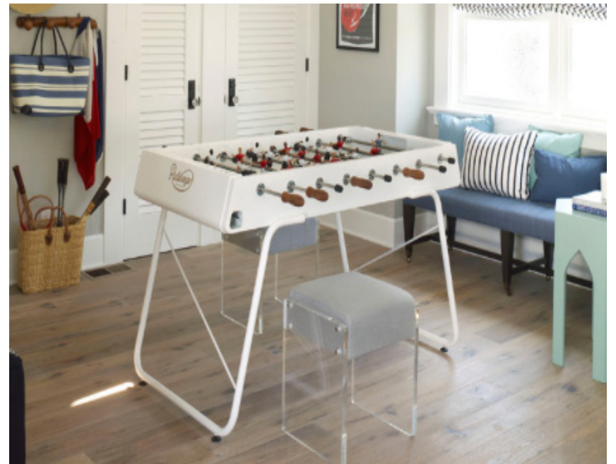
- private residence (US) -