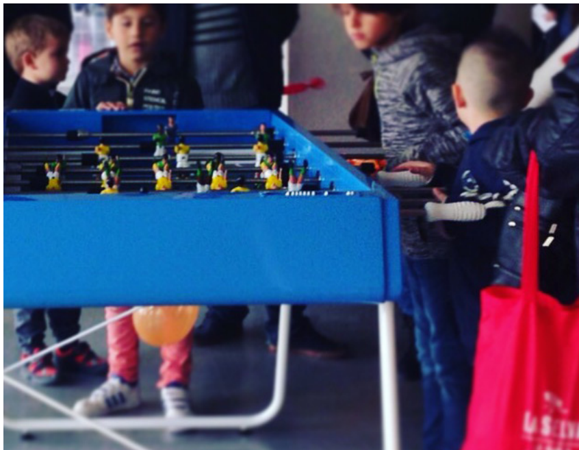
- community centre (barcelona) -