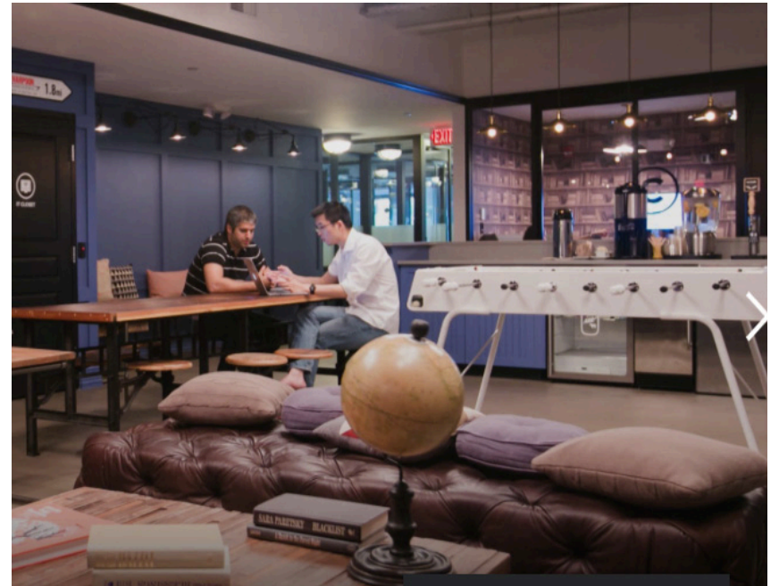
- we work (US) -