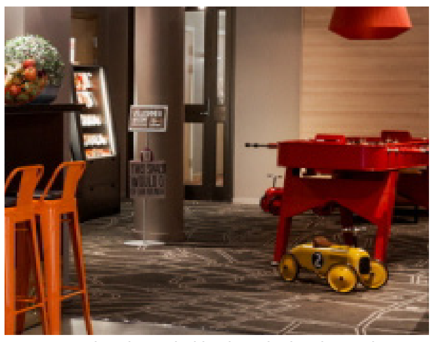
- hotel scandic klarälven (karlstad - sweden) -