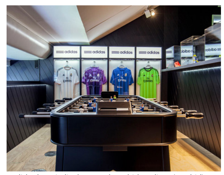
- adidas hospitality box - real madrid stadium (madrid) -