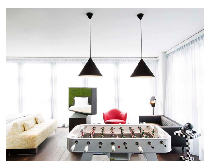
- kameha grand zürich hotel (zurich) -