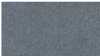
C • SKY