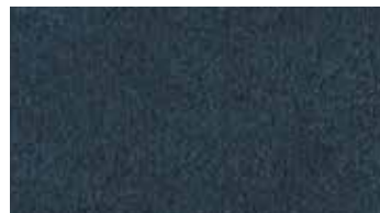
D • POWDER