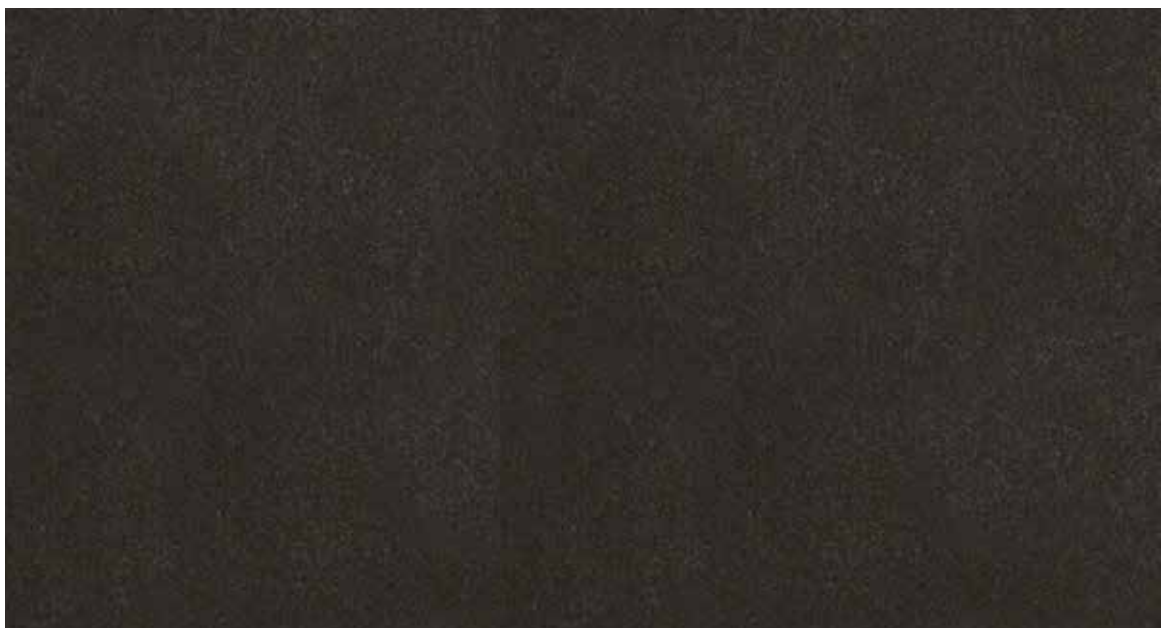
A • ANTHRACITE