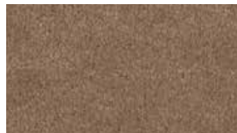
G • TERRA