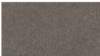
H • STONE