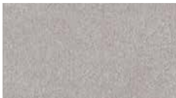
B • PEARL