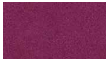
J • CYCLAMEN