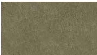
F • FERN