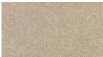
E • SEA SAND