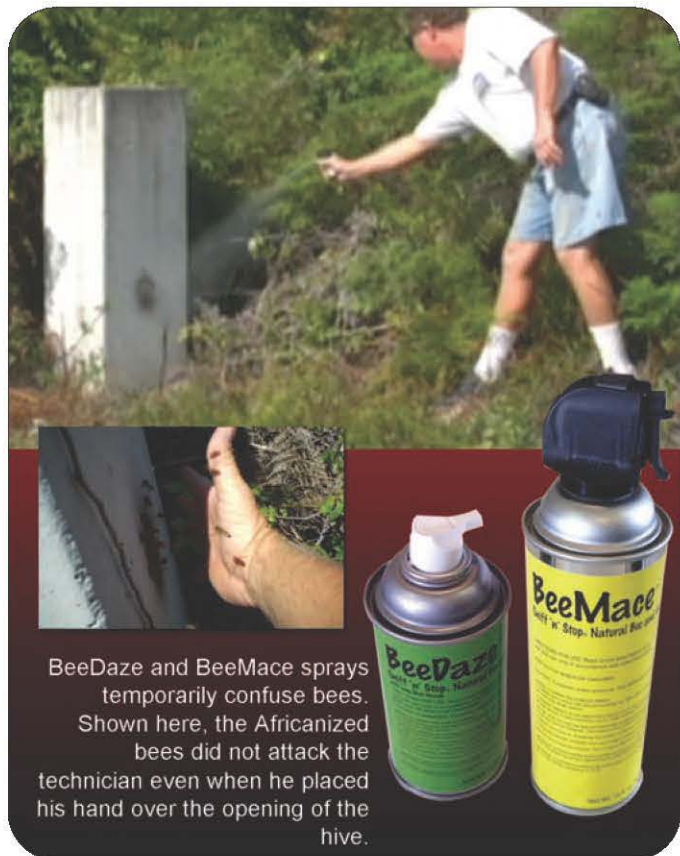
BeeDaze and BeeMace sprays temporarily confuse bees. Shown here, the Africanized bees did not attack the technician even when he placed his hand over the opening of the hive.

Landers says, "One way that has been discovered to release these warning pheromones in any organism is to confuse it. Several methods can be used to accomplish this. The method the Lord has shown us is the use of unnatural combinations of natural